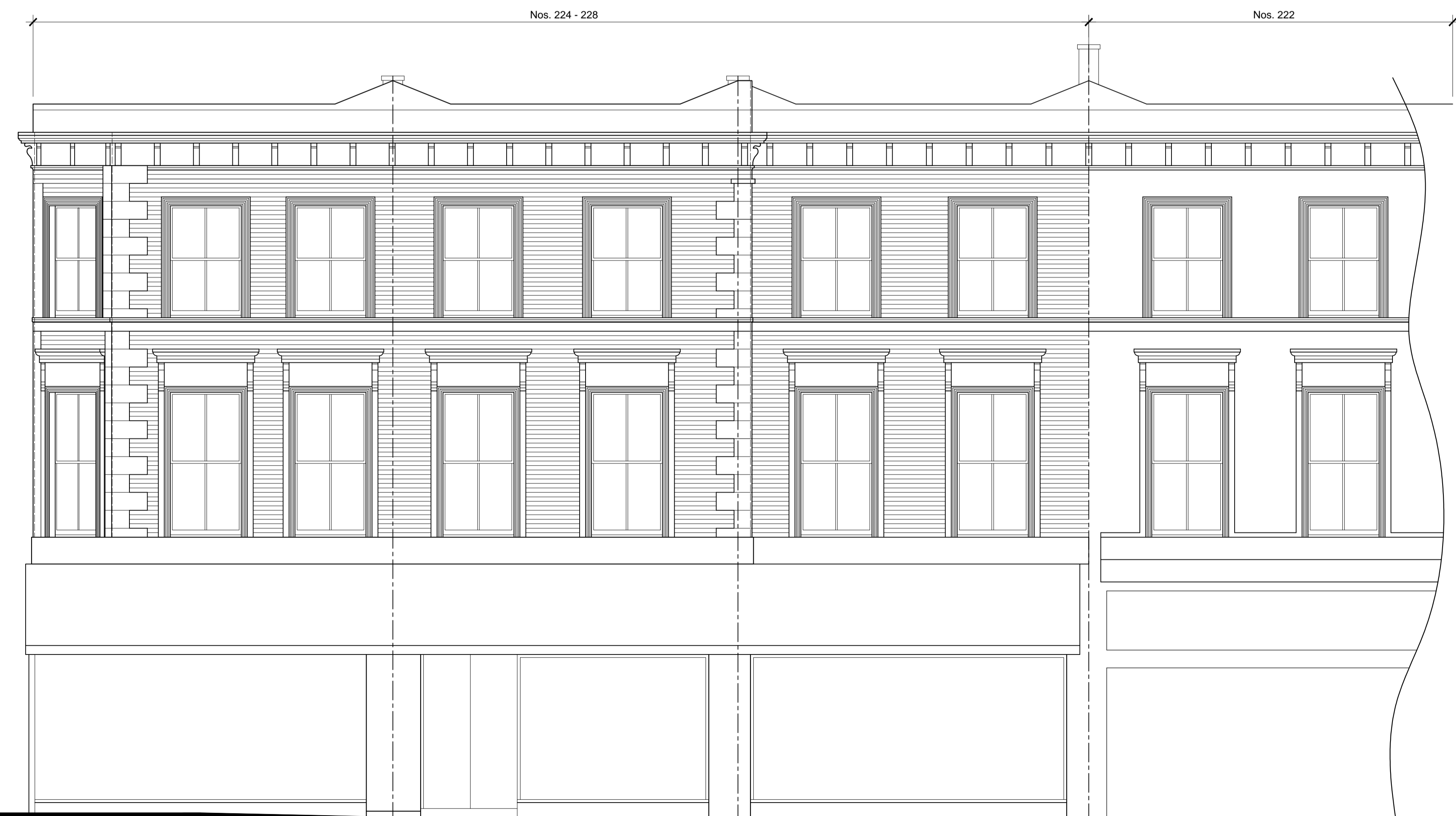
EXISTING FRONT ELEVATION - KENTISH TOWN ROAD