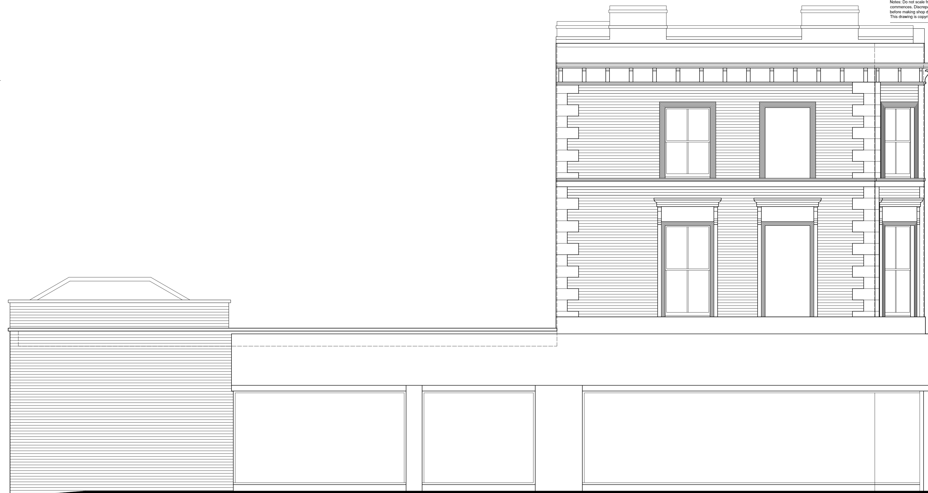
EXISTING SIDE ELEVATION - CAVERSHAM ROAD