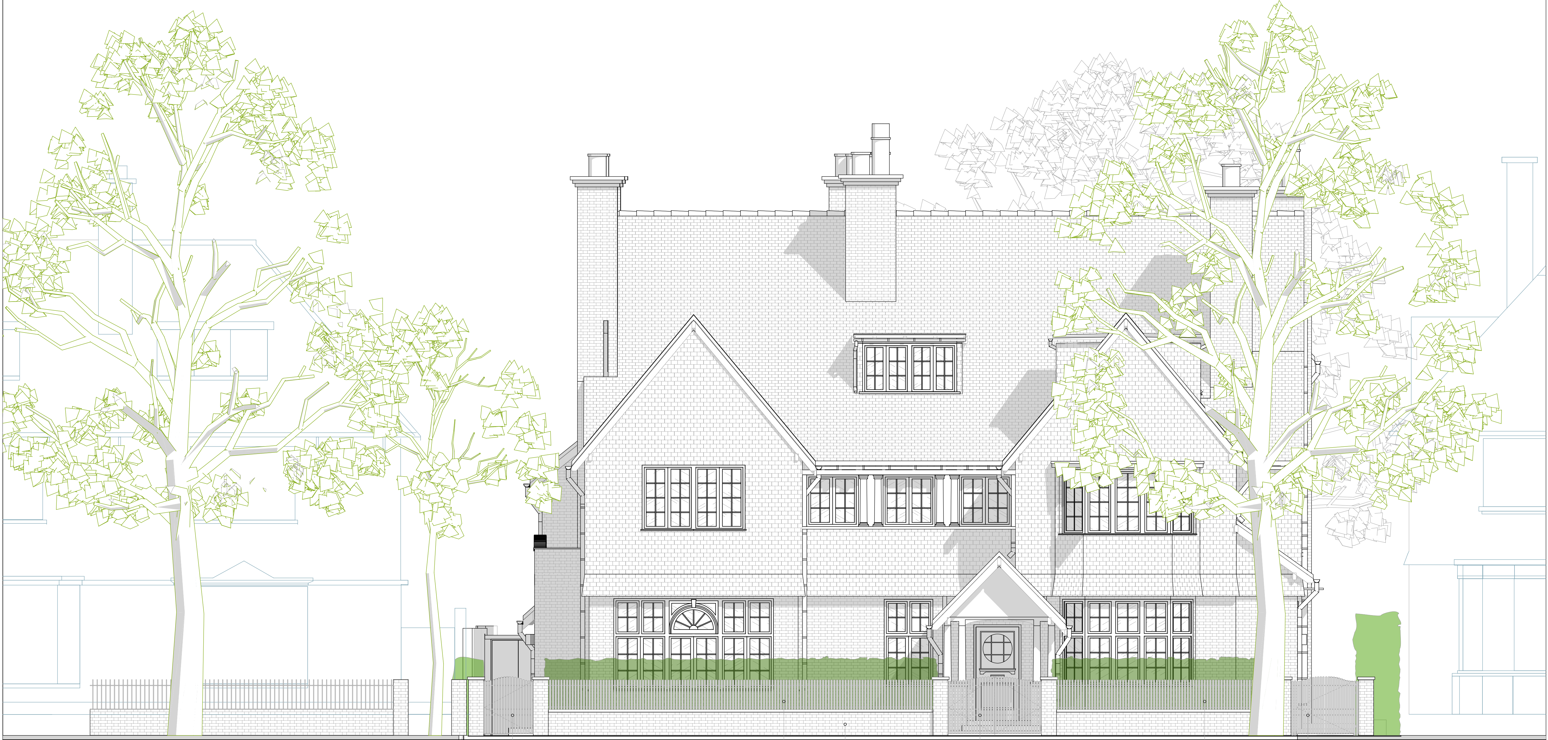
SE1 street elevation as proposed 1:50

NOTES 1. This drawing must not be scaled 2. The contractor is to check all dimensions on site