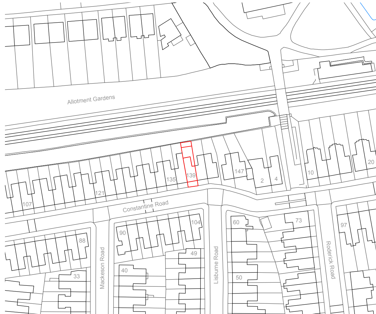
1 Location Plan 1:1250