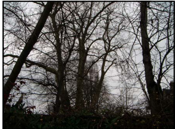
4. View through Limes G3 to London Plane T4