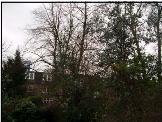
5. View of neighbouring property in No. 101