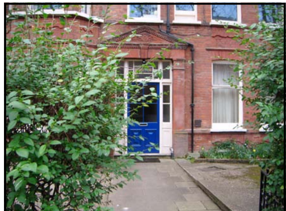
6. H1 Privet