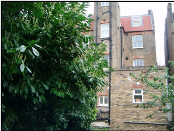
3. View of rear