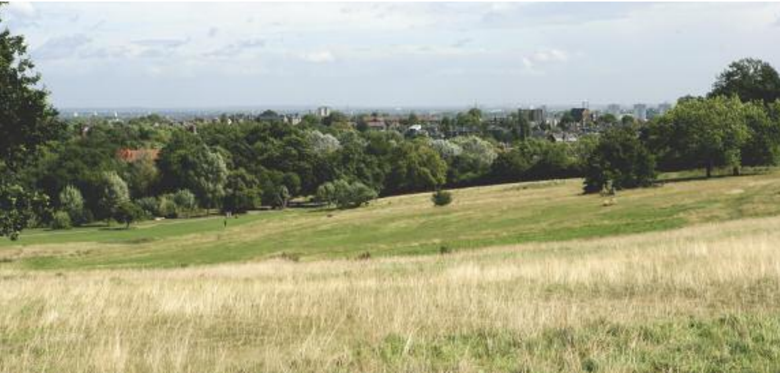
Table 1. Thresholds for open space provision on-site