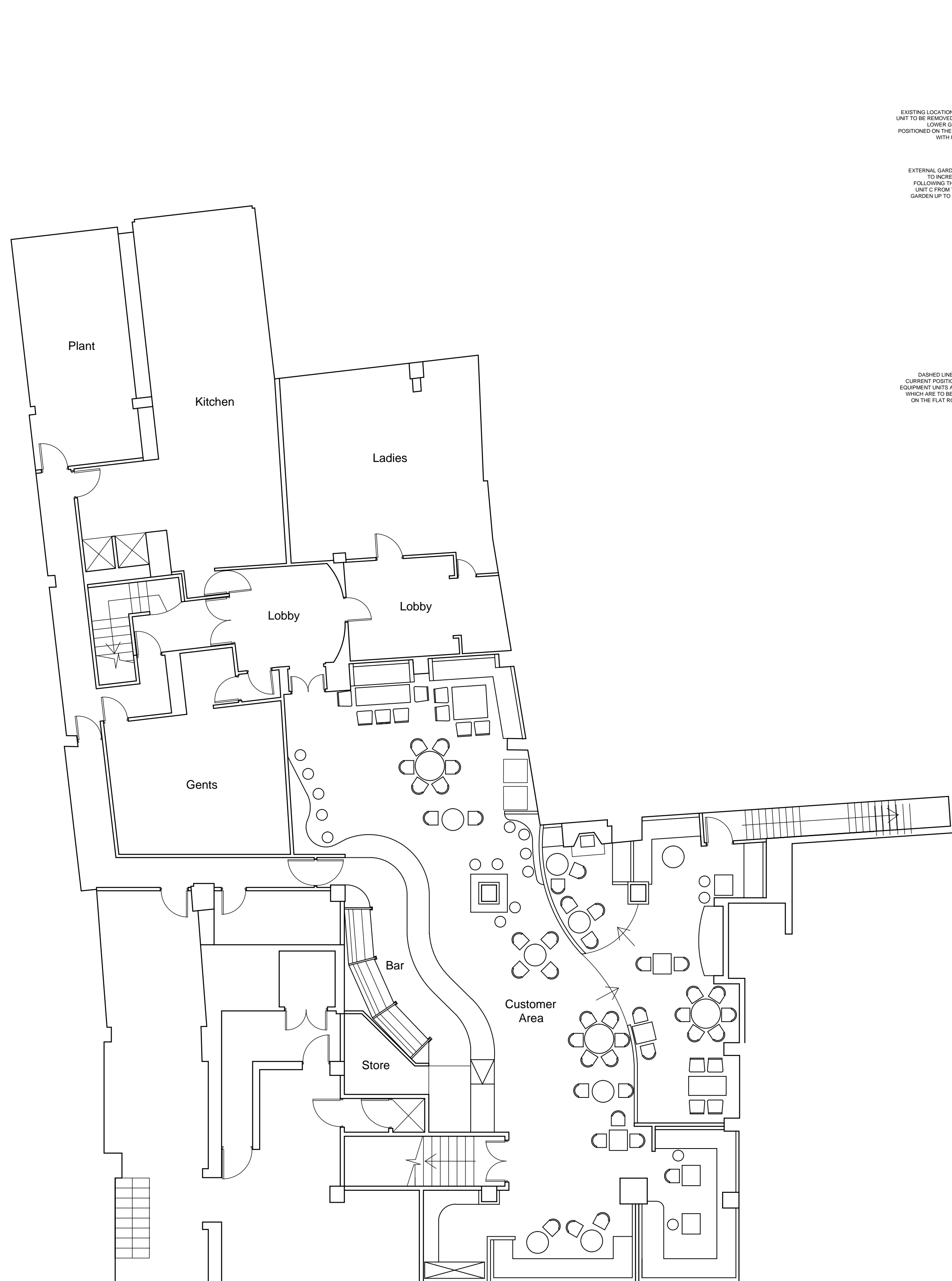
EXISTING BASEMENT PLAN Scale 1:100