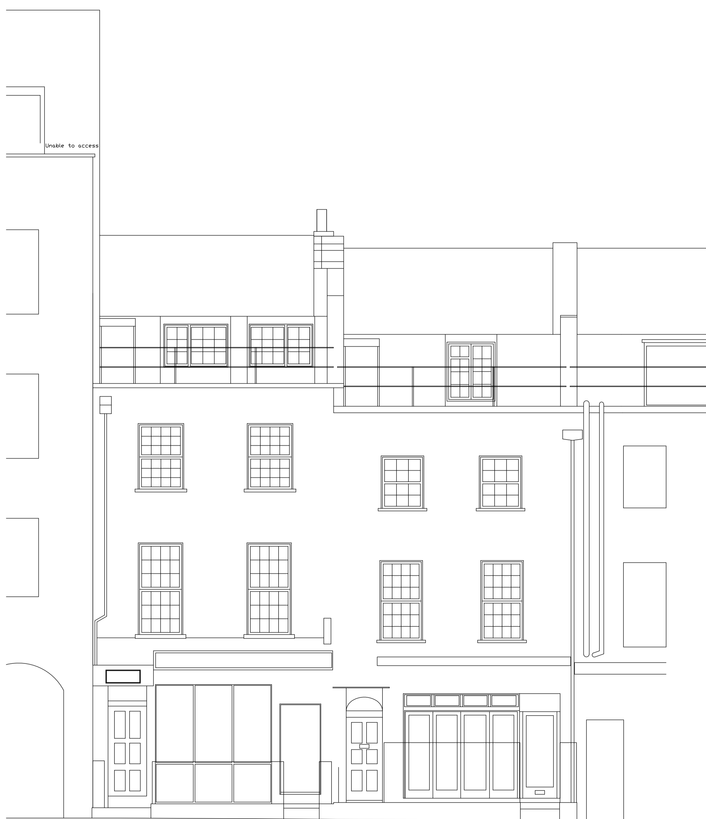
No 124 FRONT ELEVATION