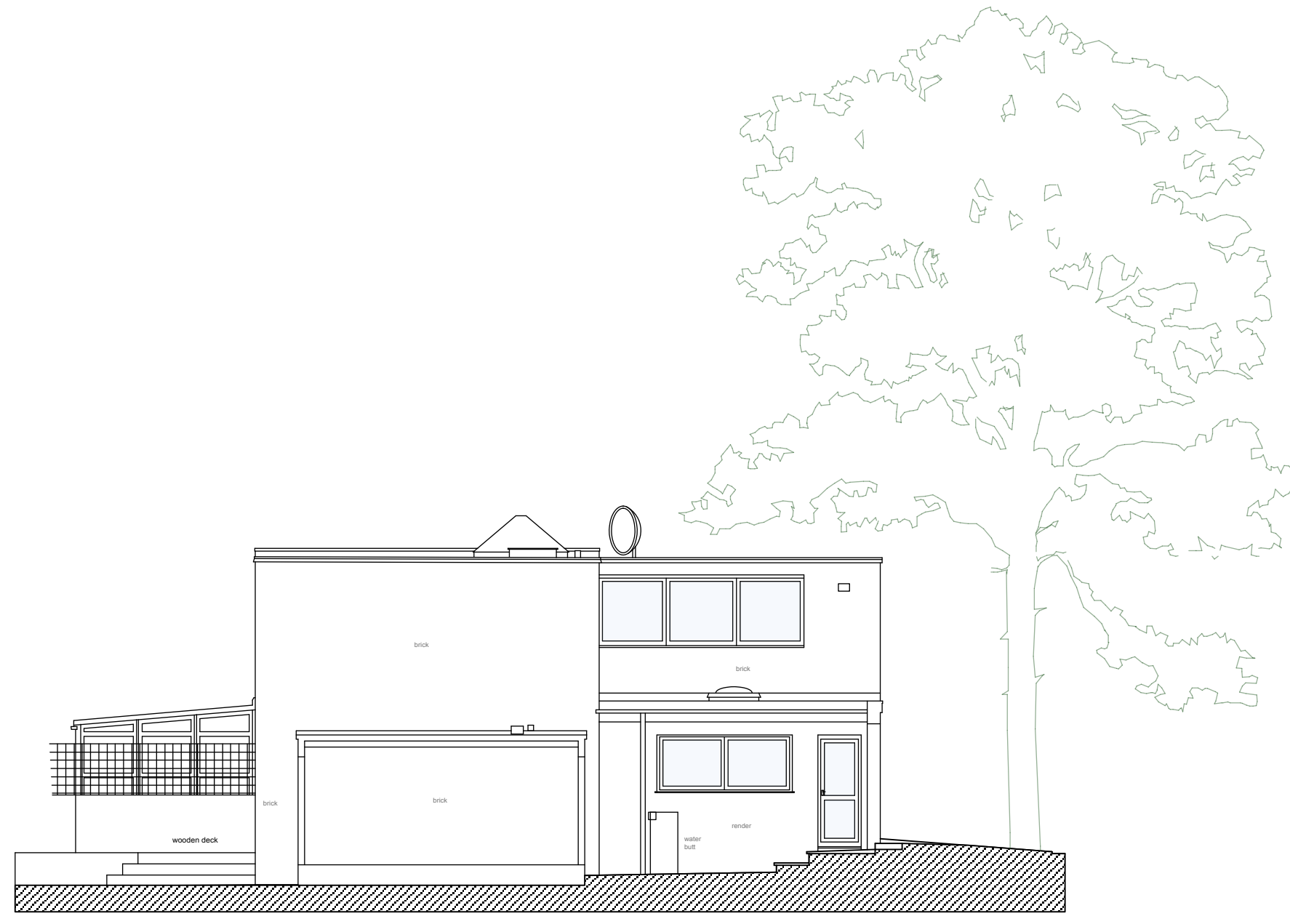
EAST ELEVATION (SIDE) A.O.D. 47.00m