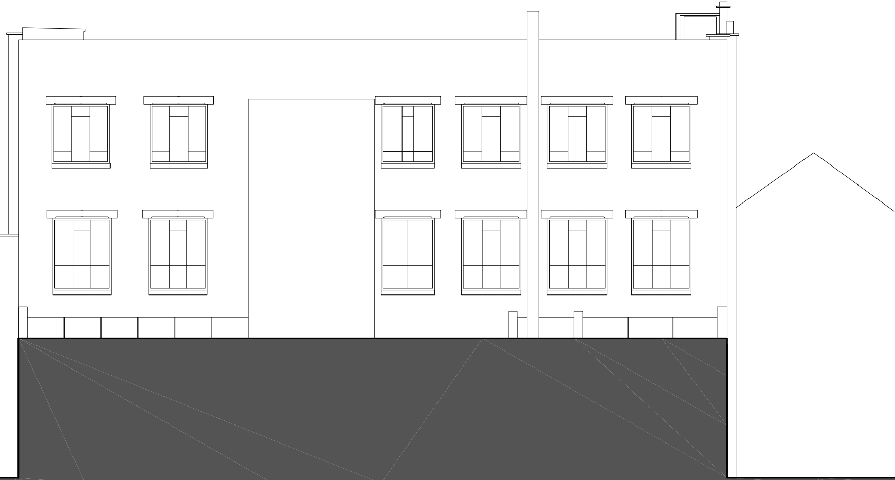
02 REAR ELEVATION 1.100