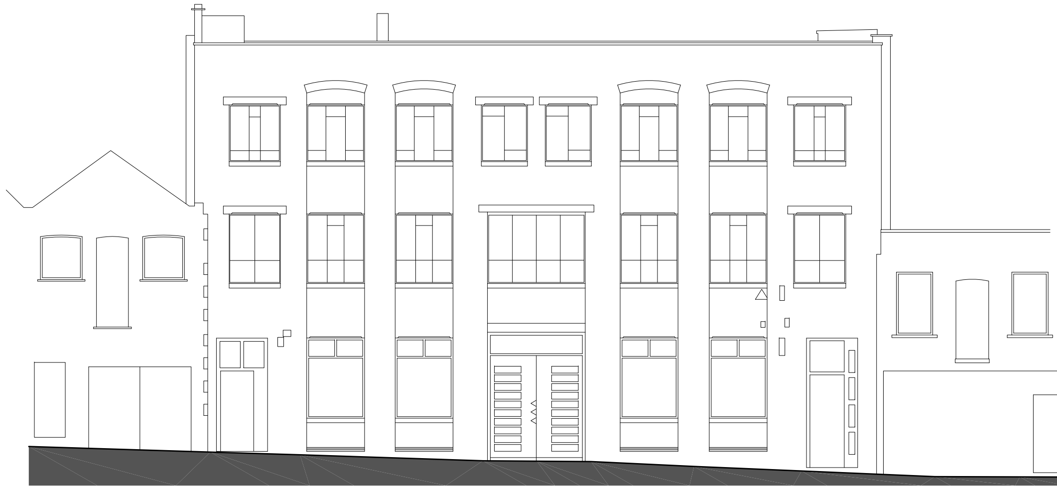
01 FRONT ELEVATION 1.100