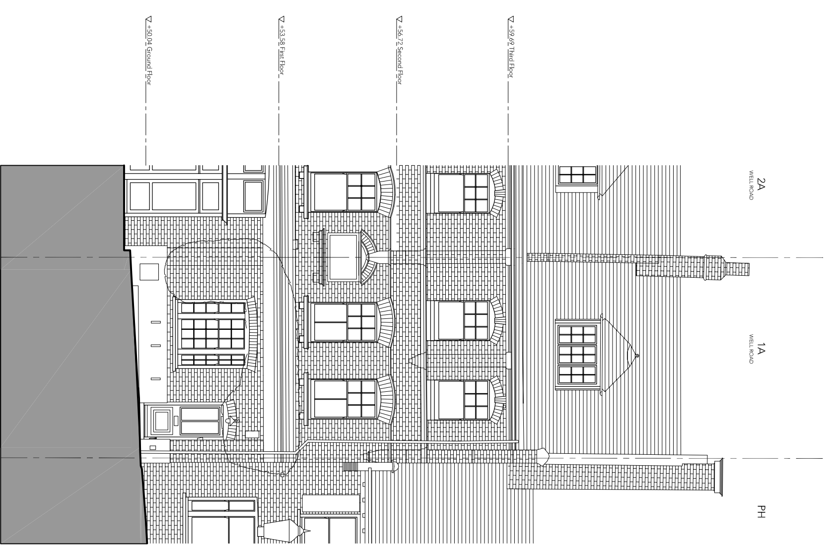
1 Existing Front Elevation scale 1:100