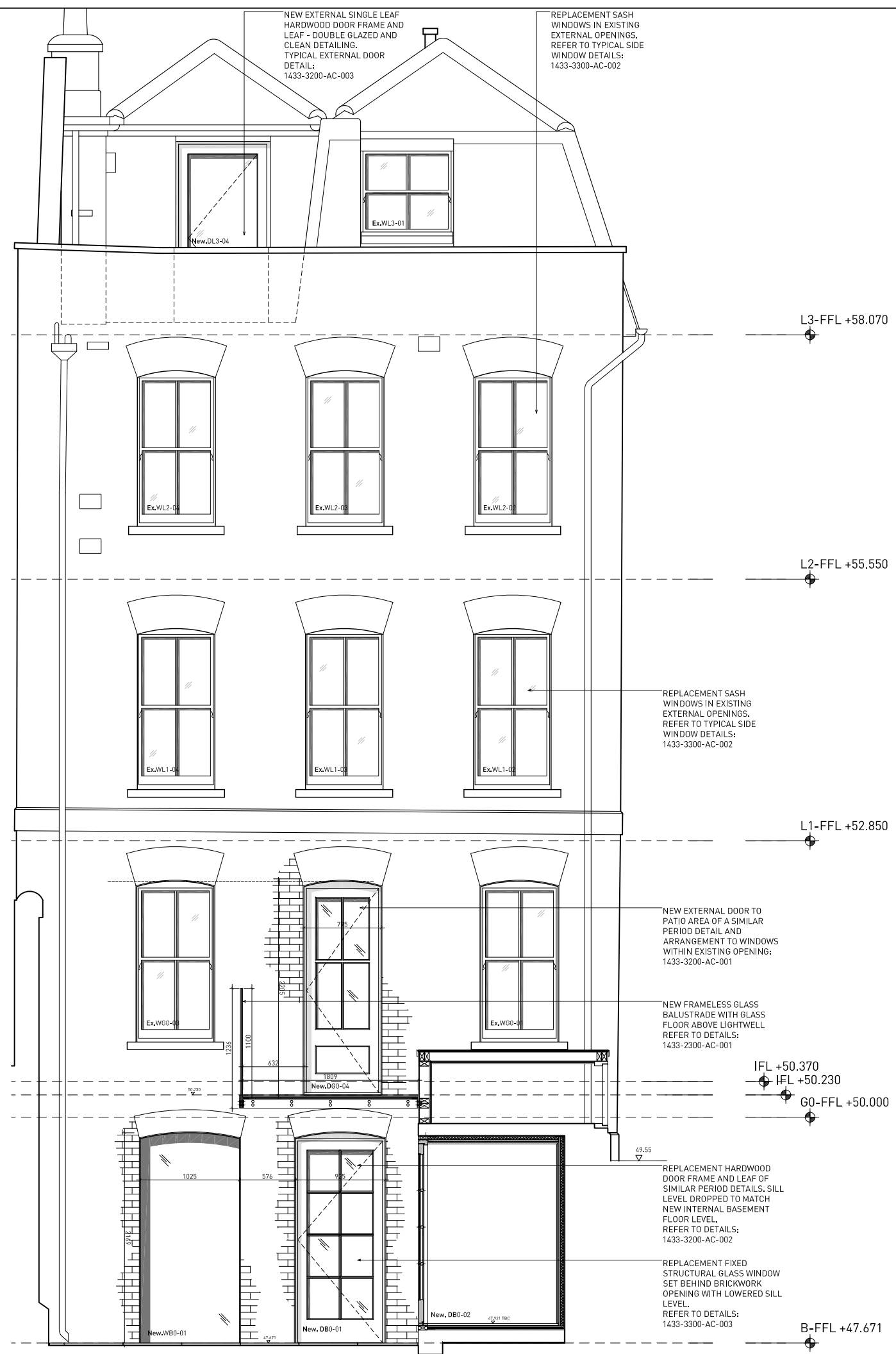
PROPOSED SOUTH ELEVATION 1:50 @ A3 1:25 @ A1