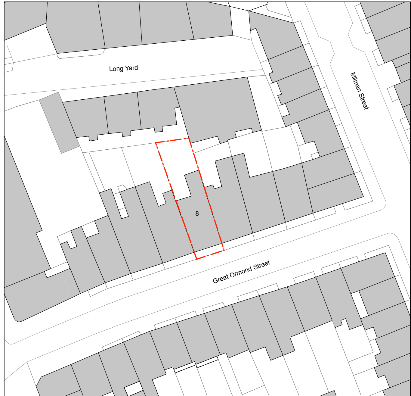
B Proposed Block Plan