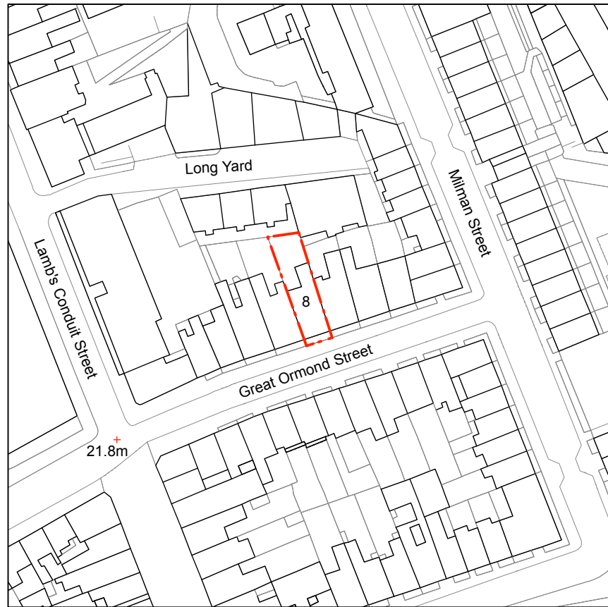
A Proposed Location Plan