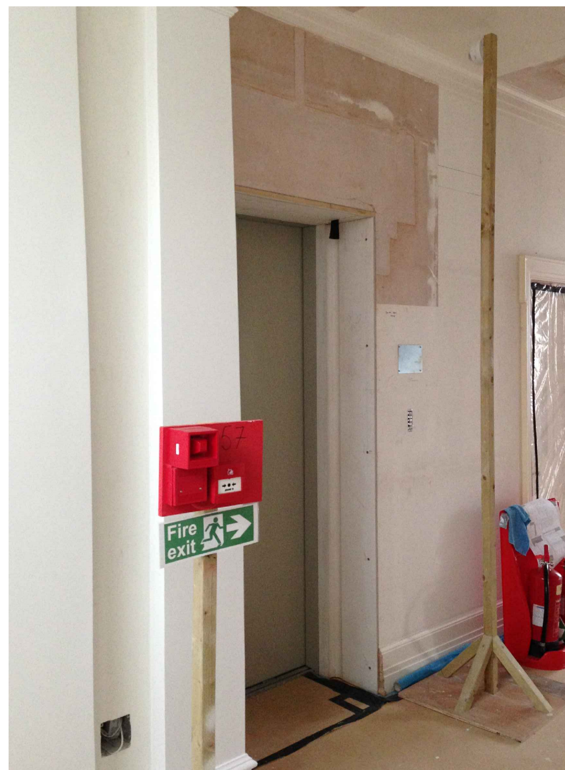
04 - VIEW OUTSIDE LIFT