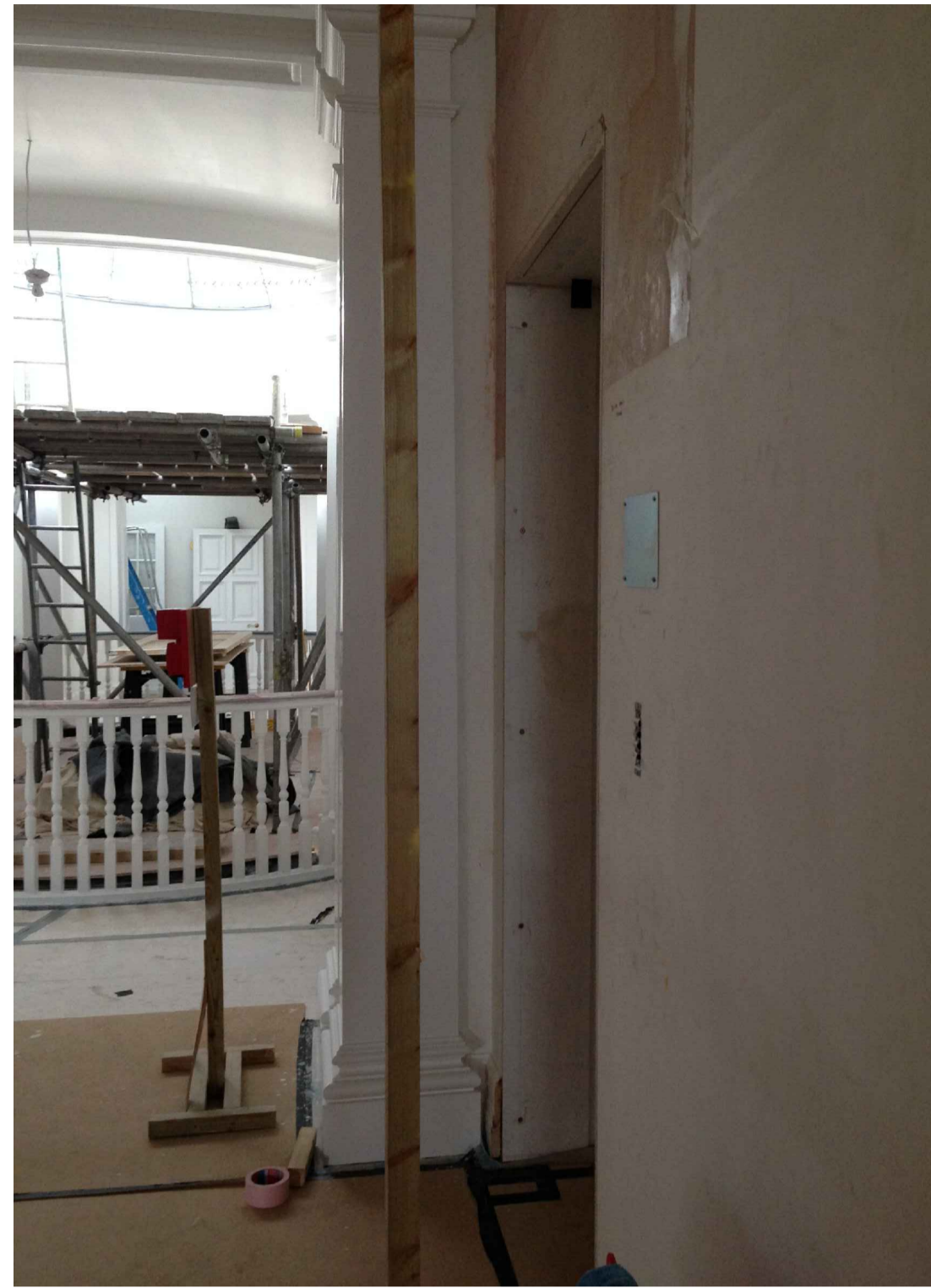
03 - VIEW OUTSIDE OF LIFT