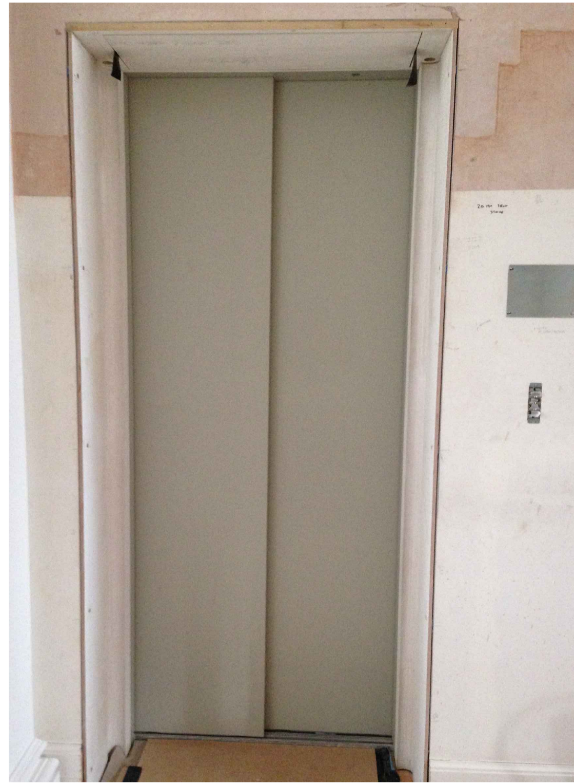
01 - PHOTO OF INSTALLED LIFT DOOR