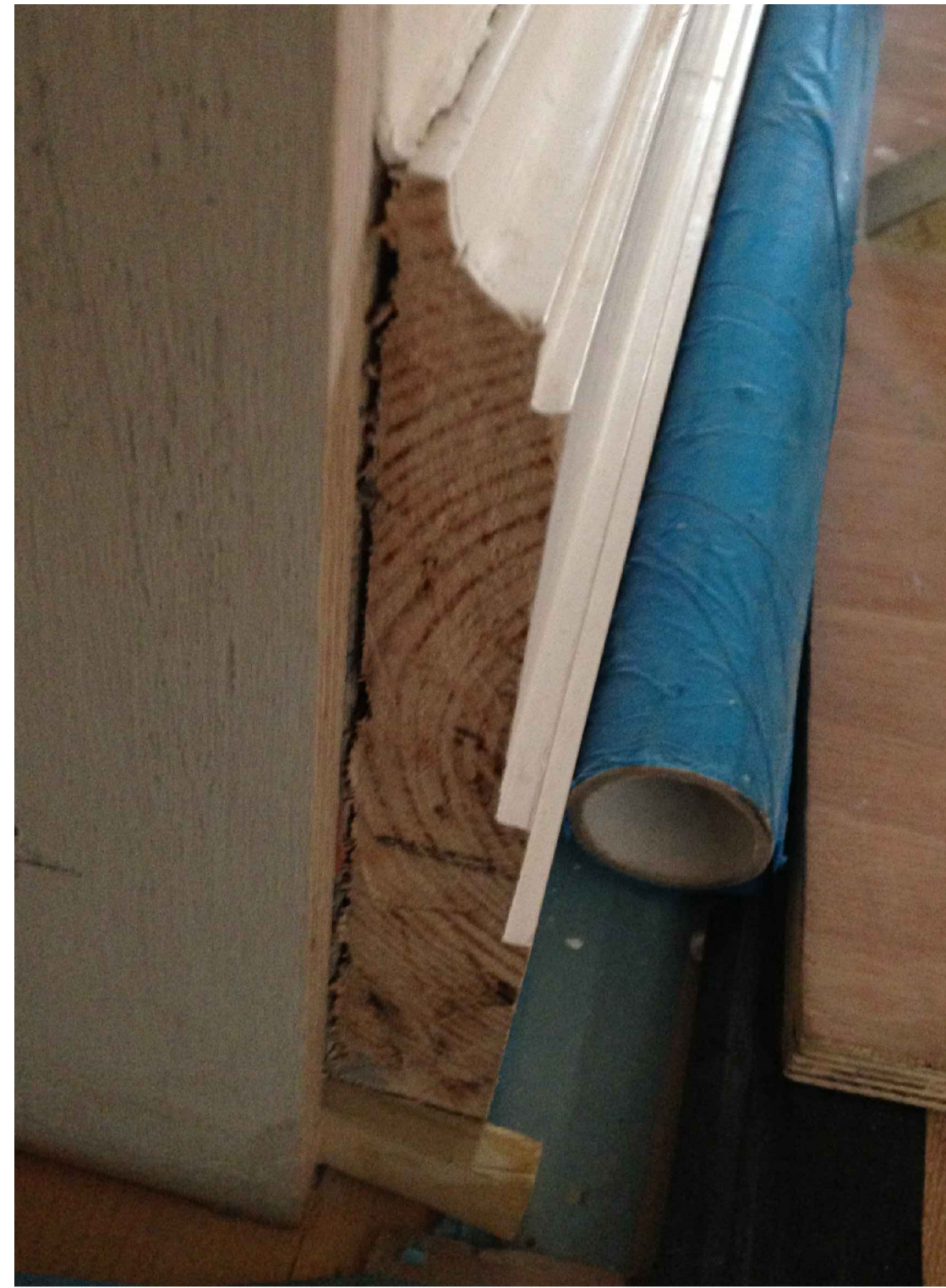
02 - SKIRTING PROFILE IN T.13