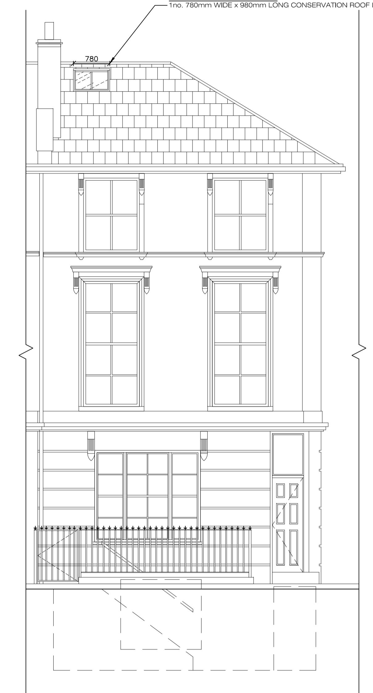
3 FRONT (EDIS STREET) ELEVATION : PROPOSED Scale 1:50

31A - BED 1 MEZZANINE LEVEL 1no. 780mm WIDE x 980mm LONG CONSERVATION ROOF LIGHT