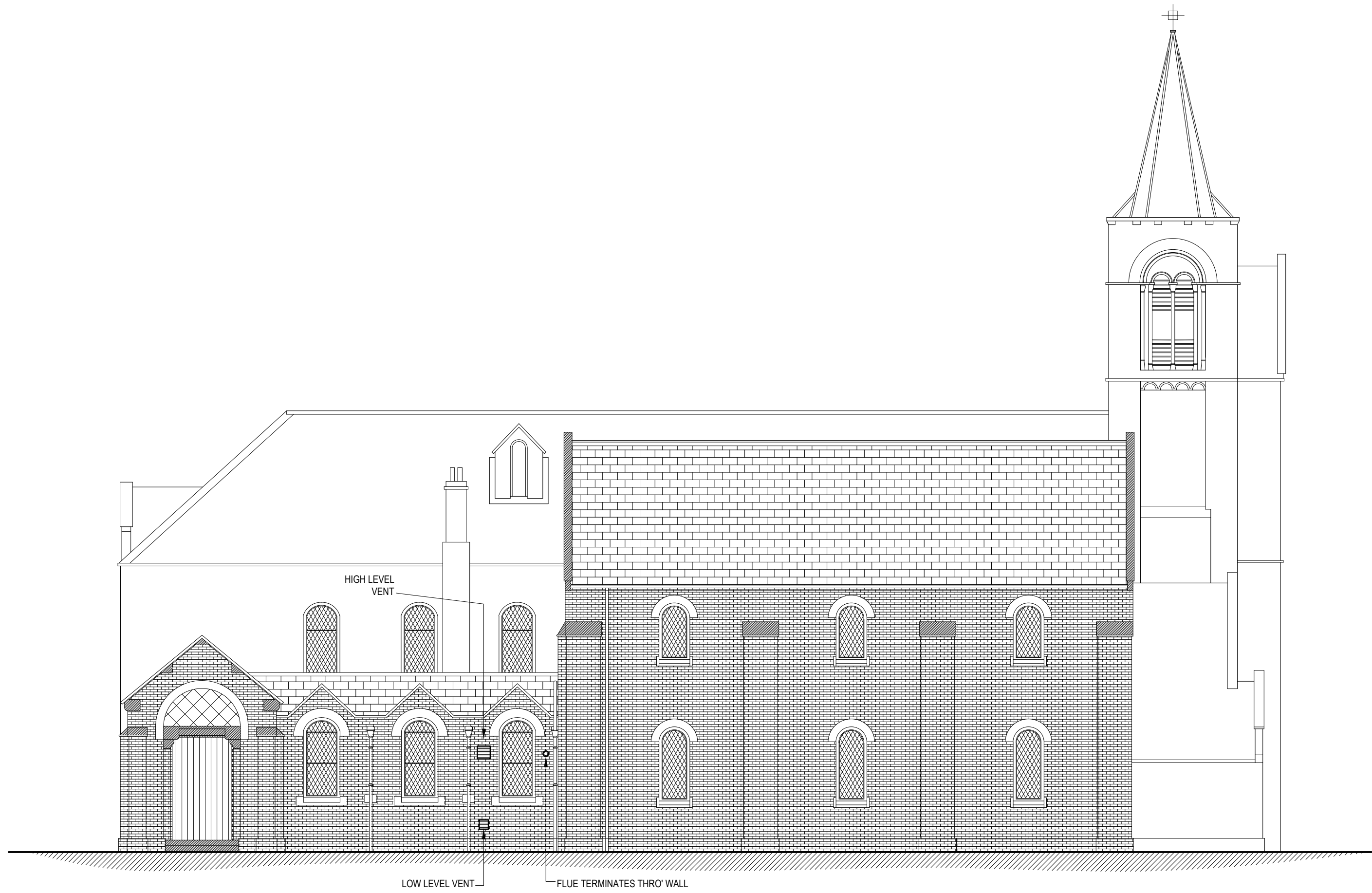
PROPOSED ELEVATION C SCALE @ 1:100