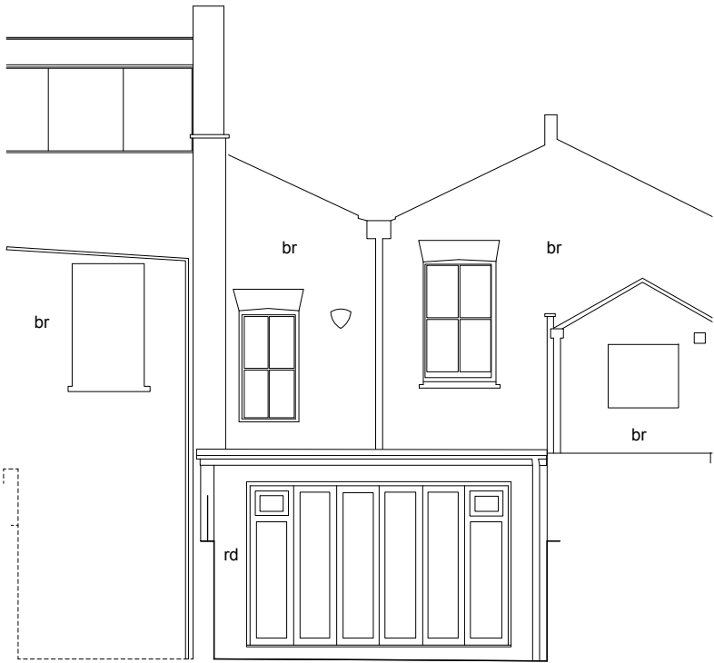
02 | Rear Elevation - EXISTING