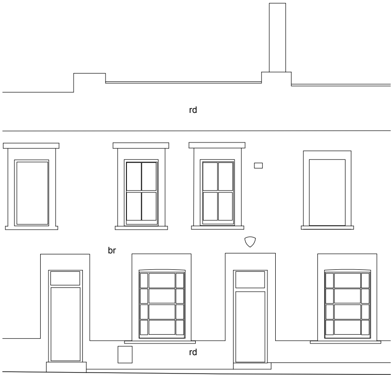
01 | FRONT Elevation - EXISTING