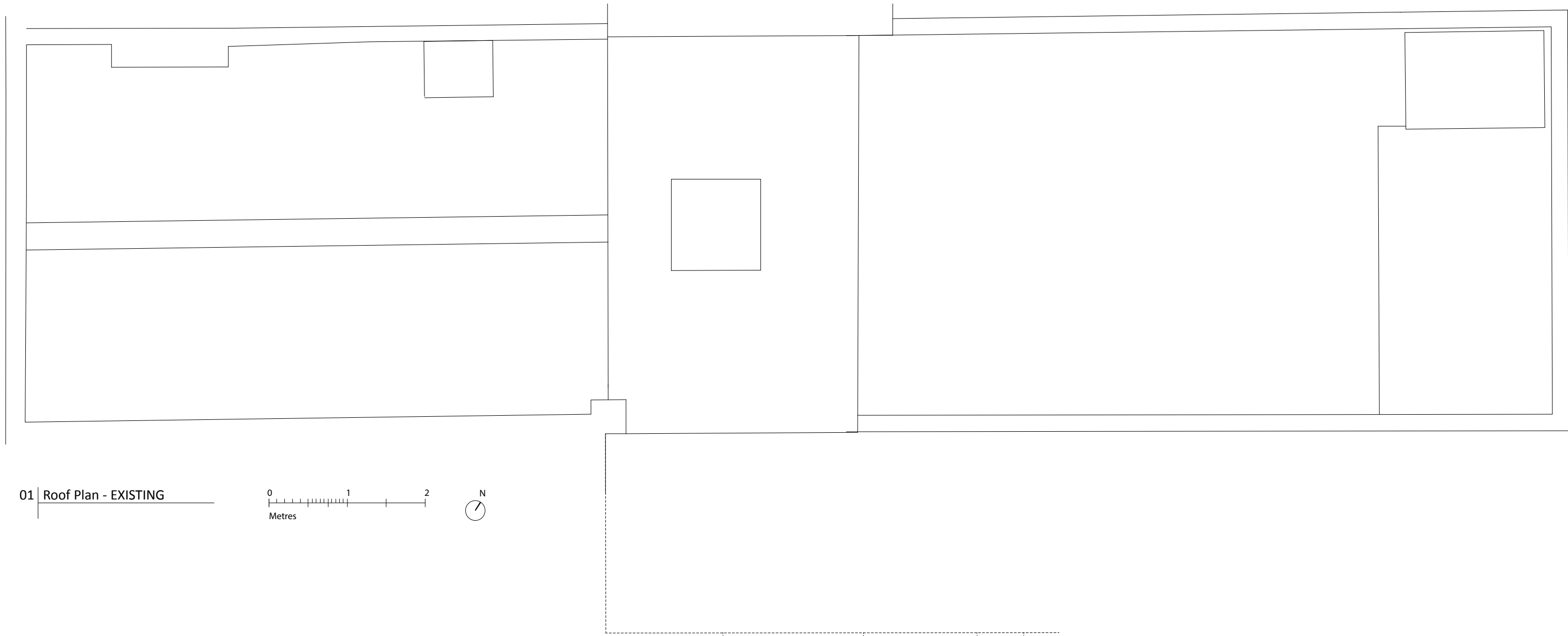
01 | Roof Plan - EXISTING

Do not scale drawings All dimensions to be checked on site, Architect to be advised of any variation between the drawings and site conditions Errors to be reported immediately to the Architect To be read in conjunction with the specification and all relevant Architects, Services and Structural Engineers Drawings