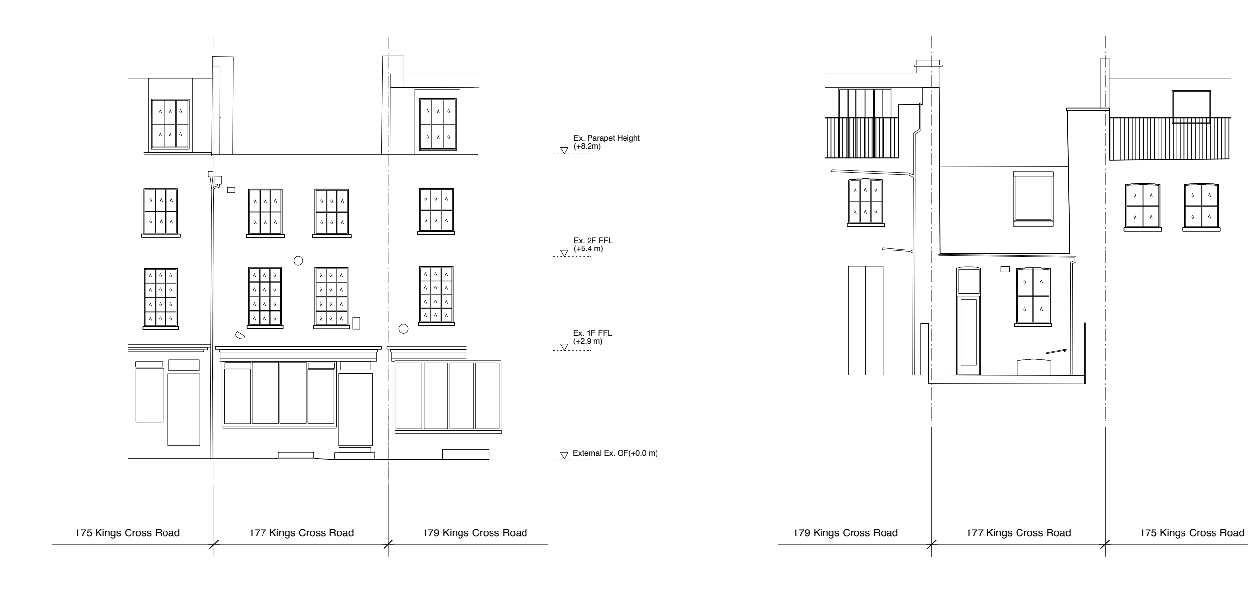
Existing Front Elevation (1:100)