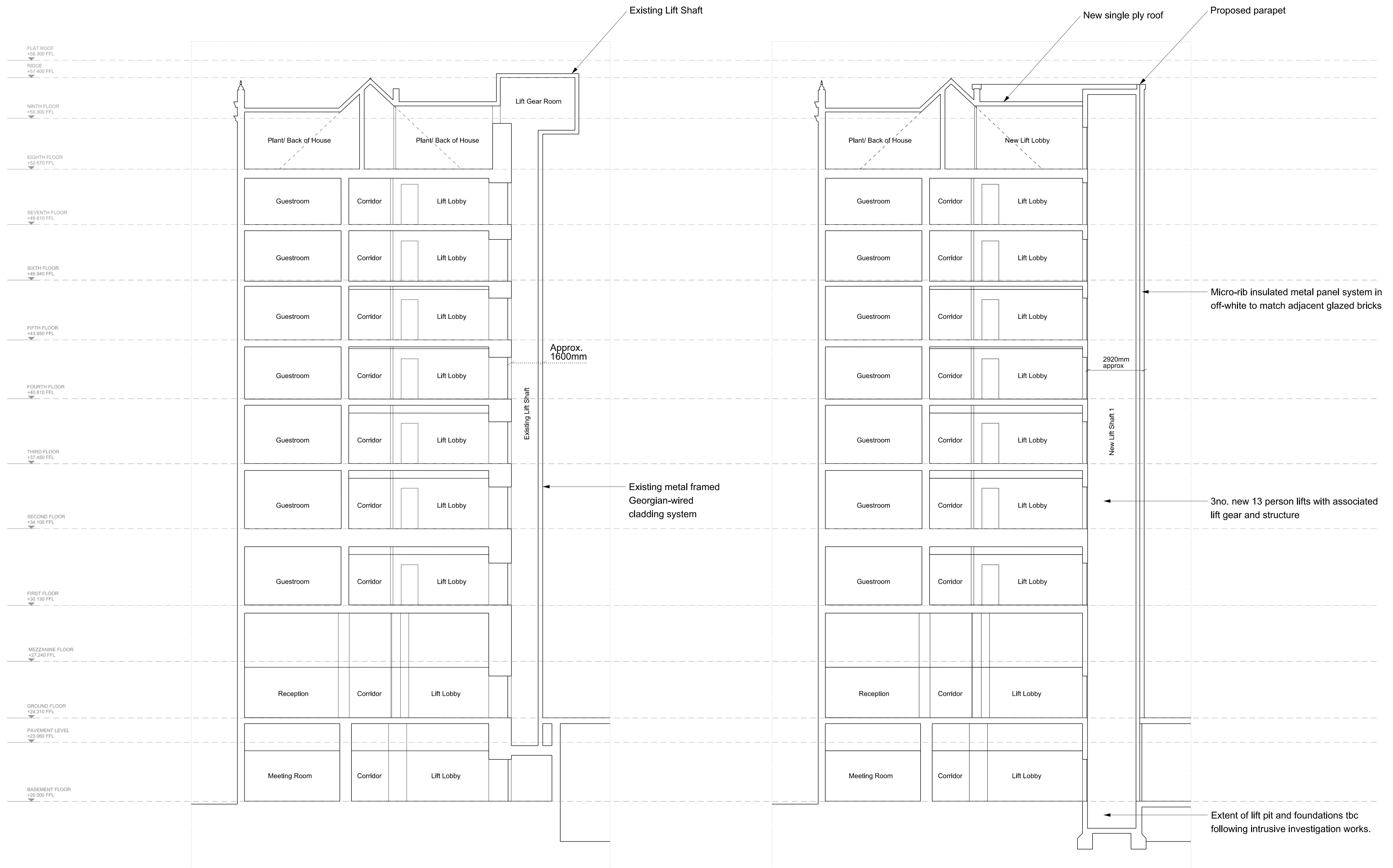
Section Through Existing Lift Shaft (within lightwell)