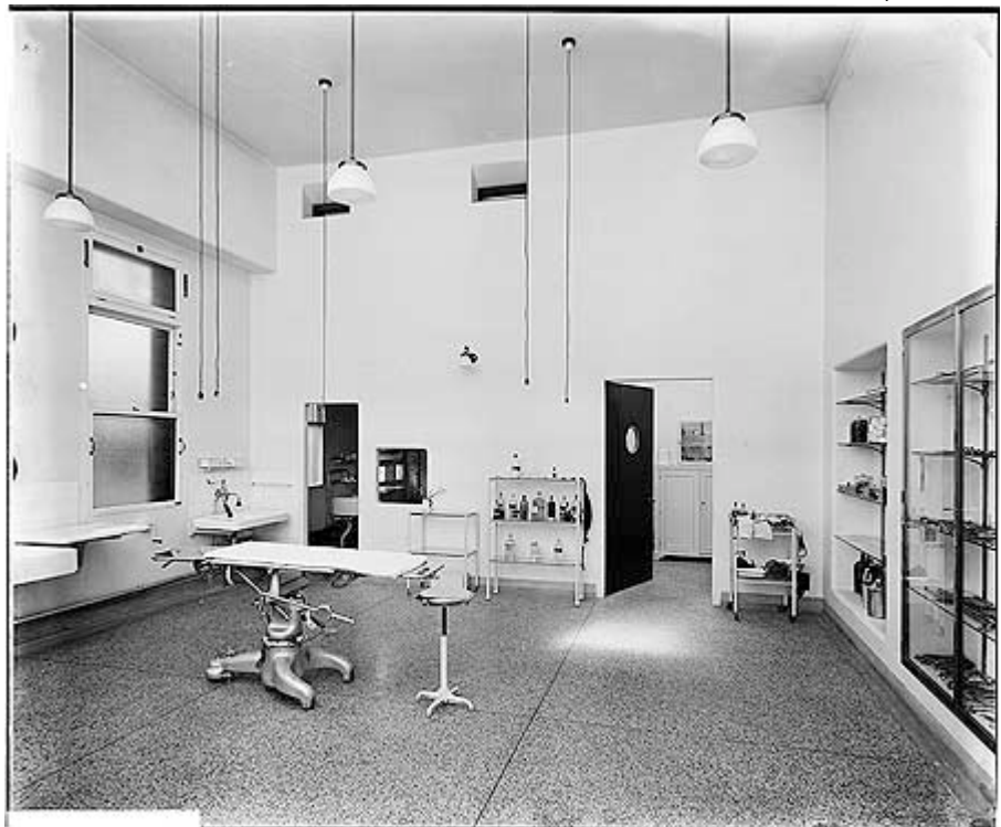
The large theatre at the Royal Ear Hospital BL28940/010