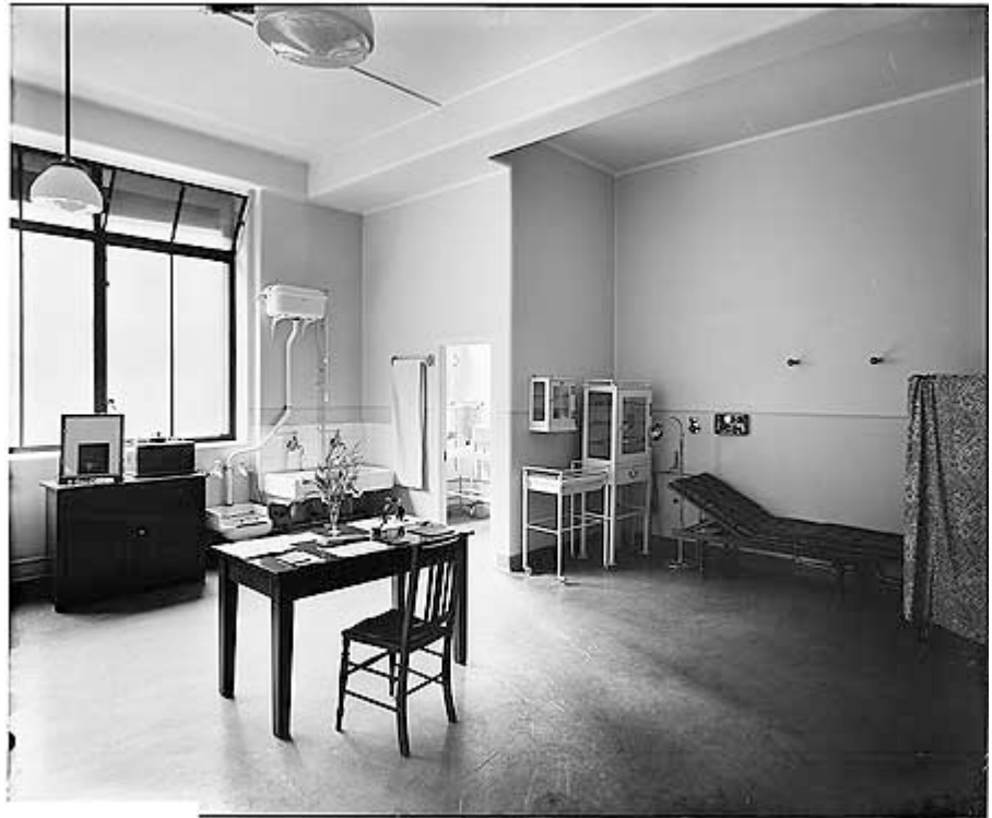
A surgeon's consulting room at the Royal Ear Hospital BL29145A