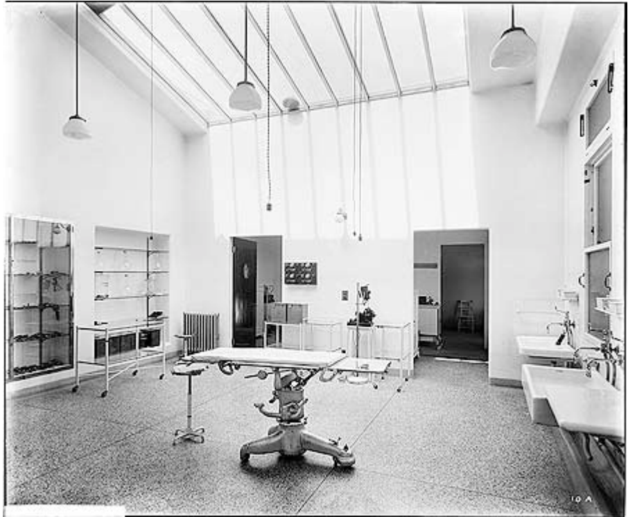
The large theatre with its skylight above at the Royal Ear Hospital BL28940/010A