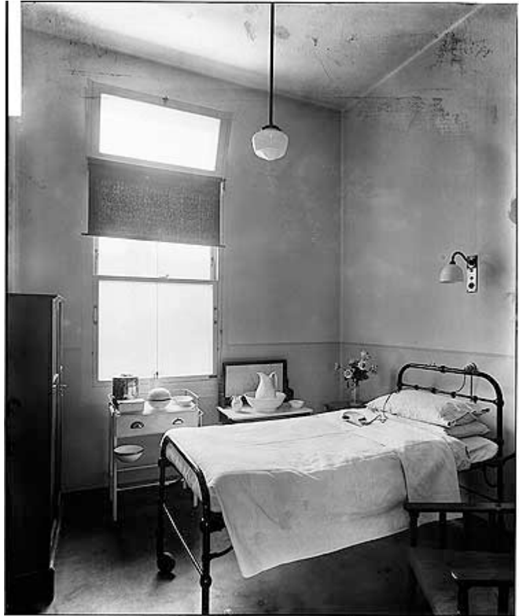
A private ward at the Royal Ear Hospital BL28940/011