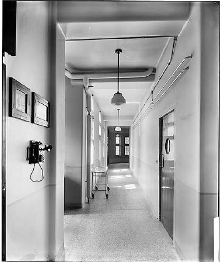
The 3rd floor corridor at the Royal Ear Hospital, with sunlight coming through the windows BL28940/009A