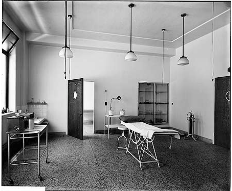
The theatre at the Royal Ear Hospital BL28940/003