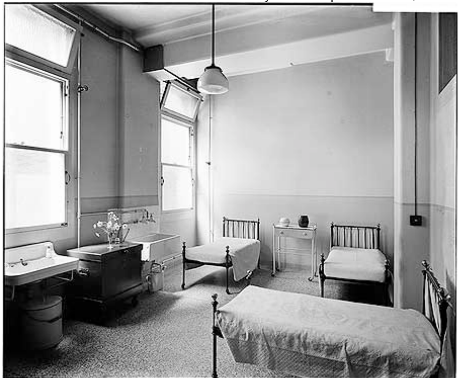
The recovery room at the Royal Ear Hospital BL28940/004