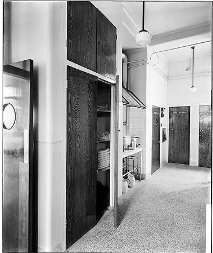
The service passage at the Royal Ear Hospital BL28940/012