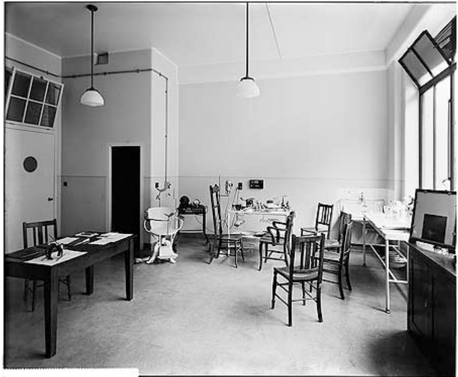
A surgeon's consulting room at the Royal Ear Hospital BL29144