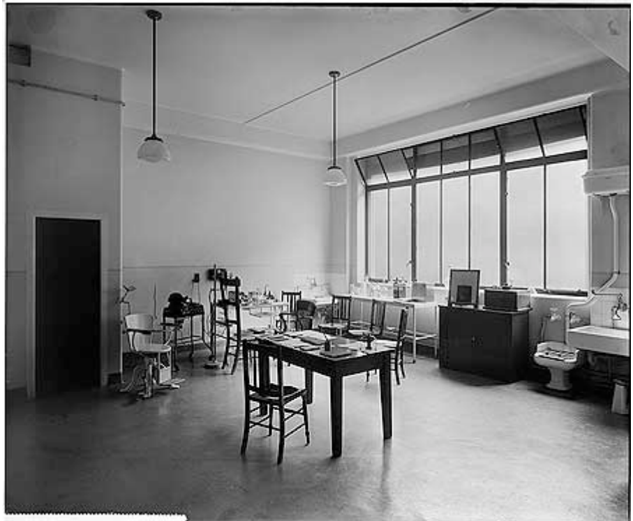
A surgeon's consulting room at the Royal Ear Hospital BL29145