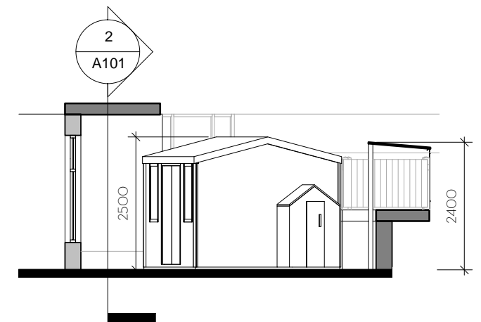
3. Existing Section