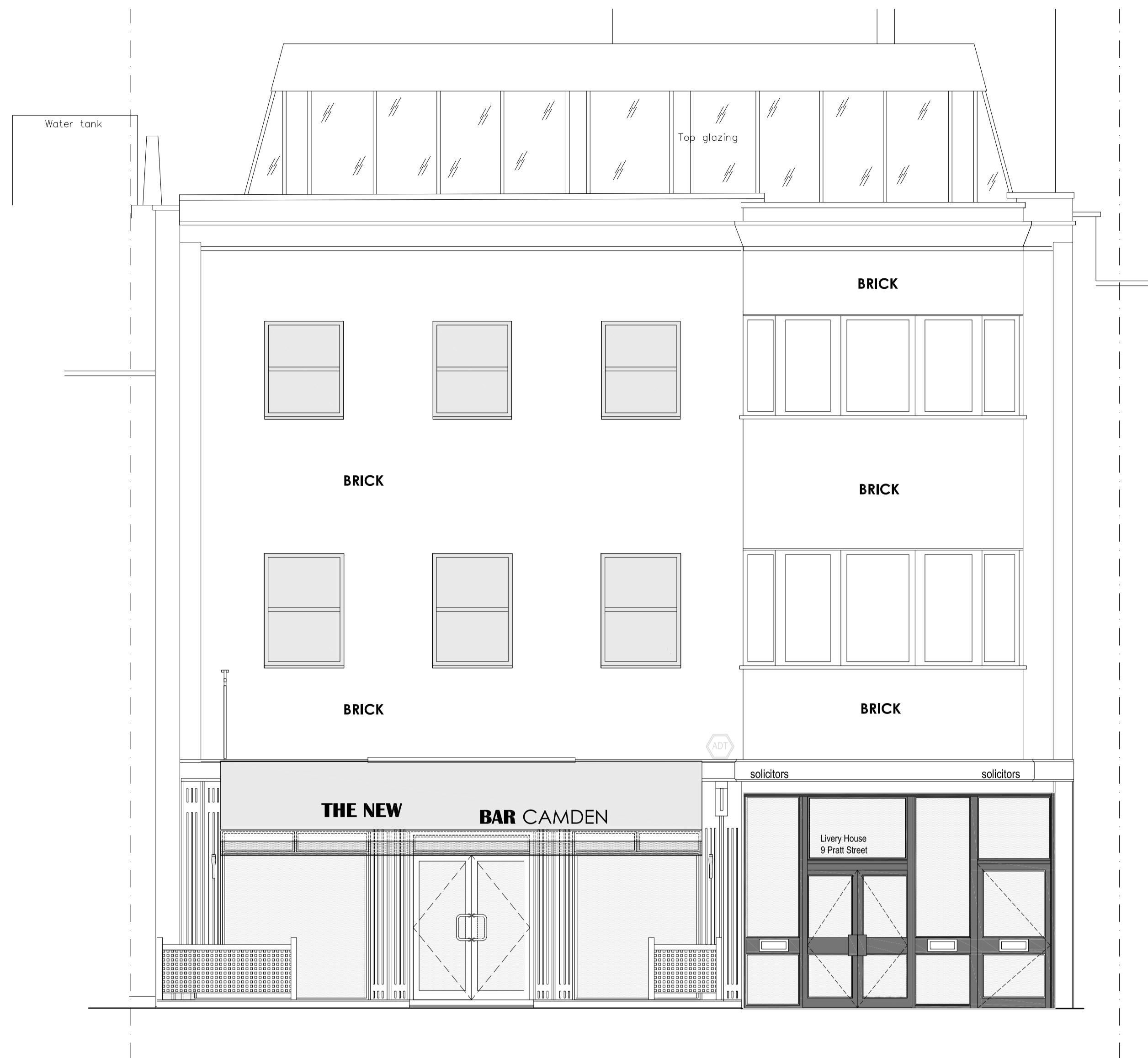
2 EXISTING FRONT ELEVATION