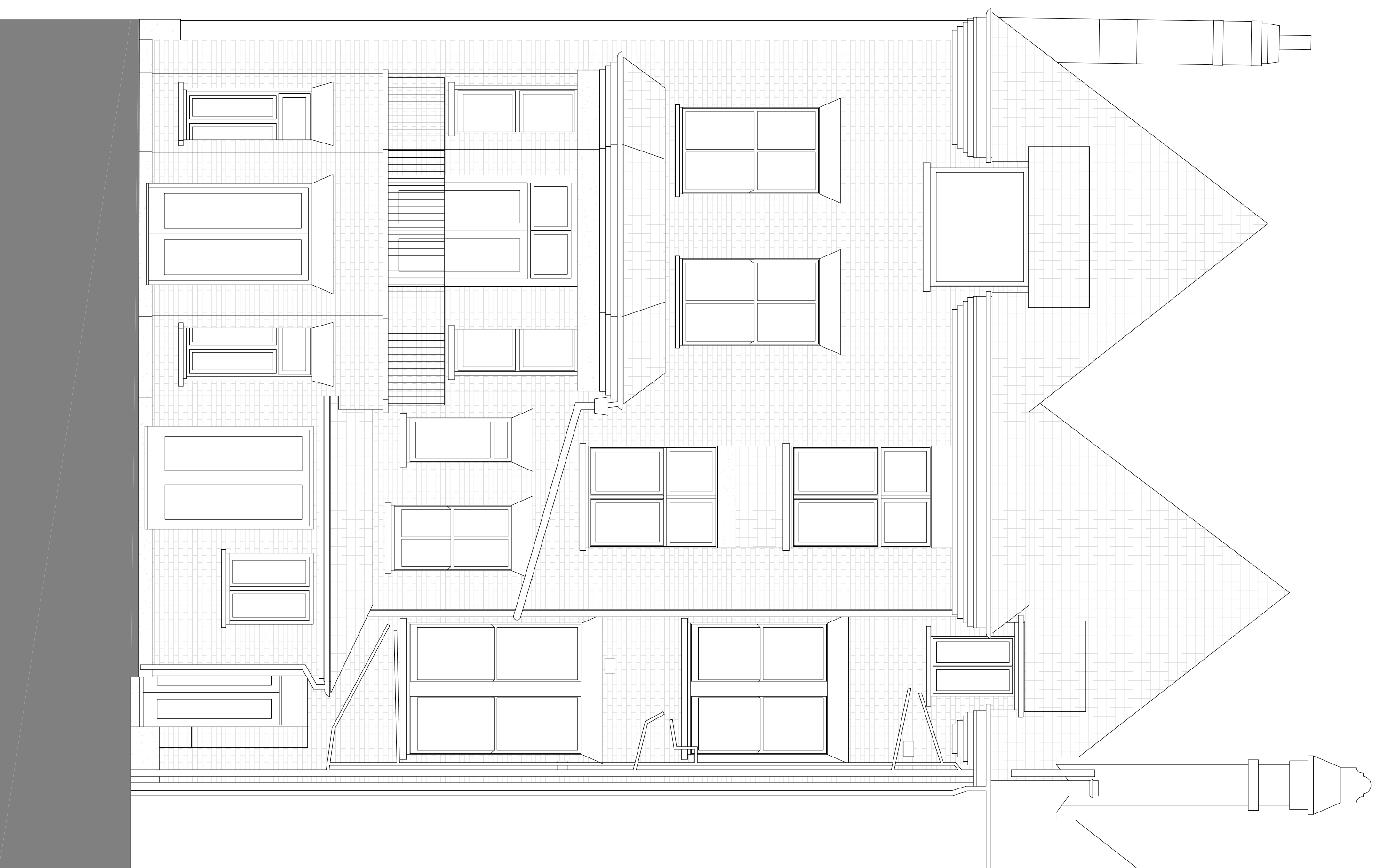
EXISTING REAR ELEVATION SCALE 1:100@A3