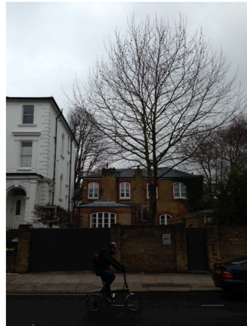
ABBEY ROAD ELEVATION