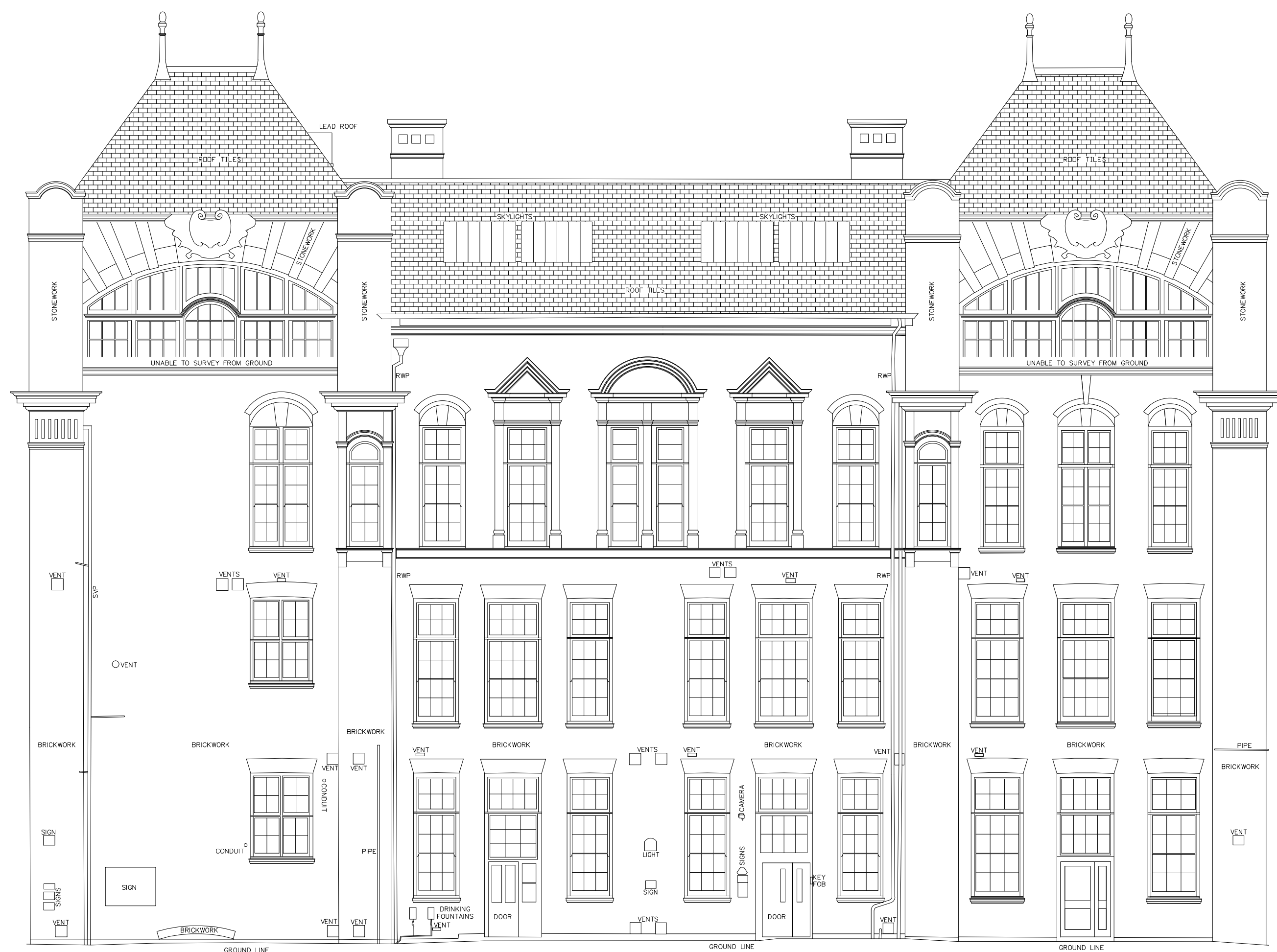
Proposed Elevation 1 - North West Elevation