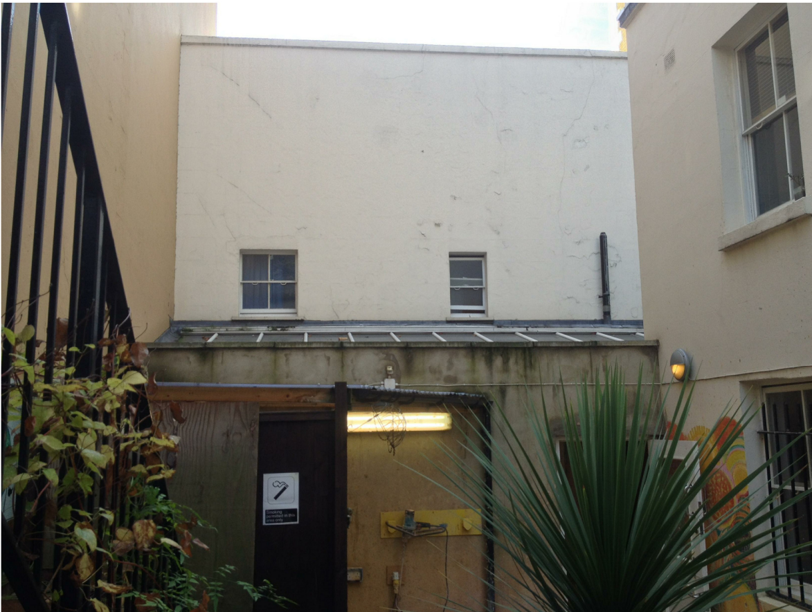
3. View towards existing extension