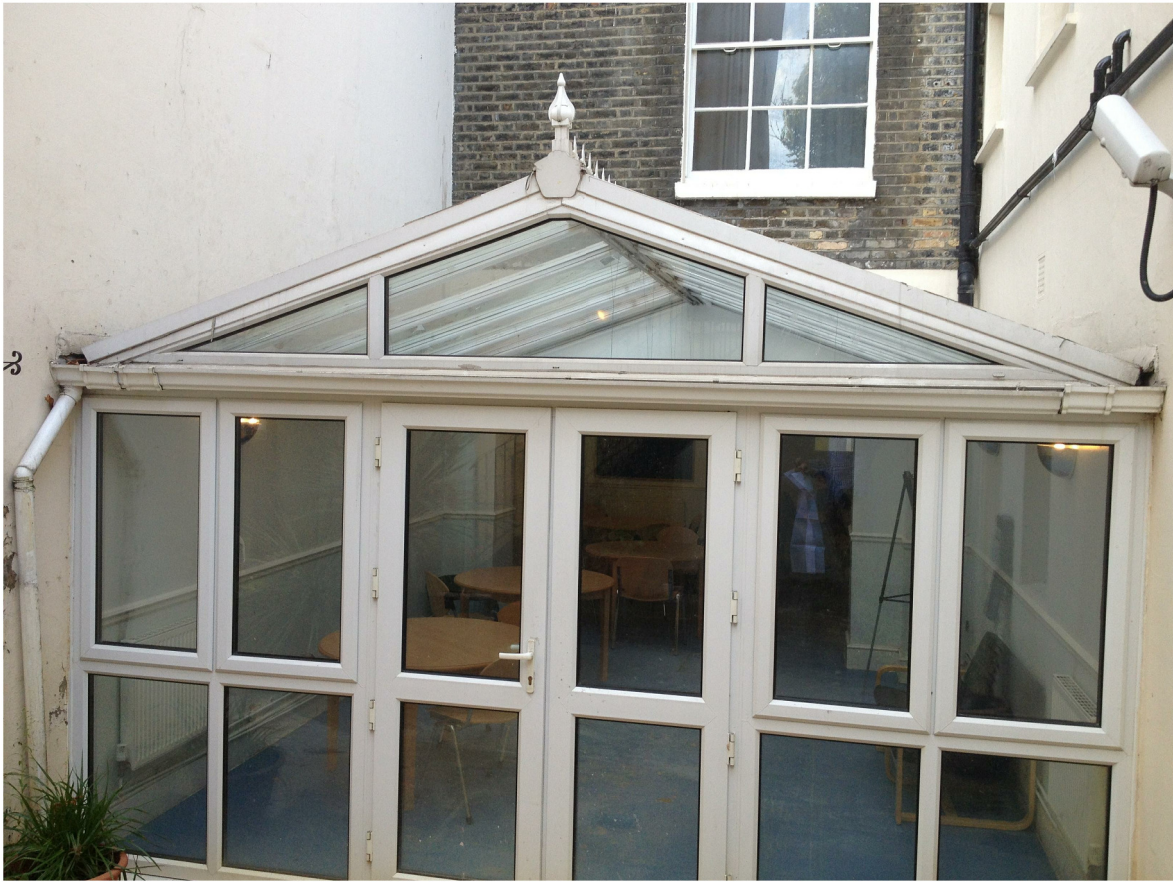
2. Existing conservatory