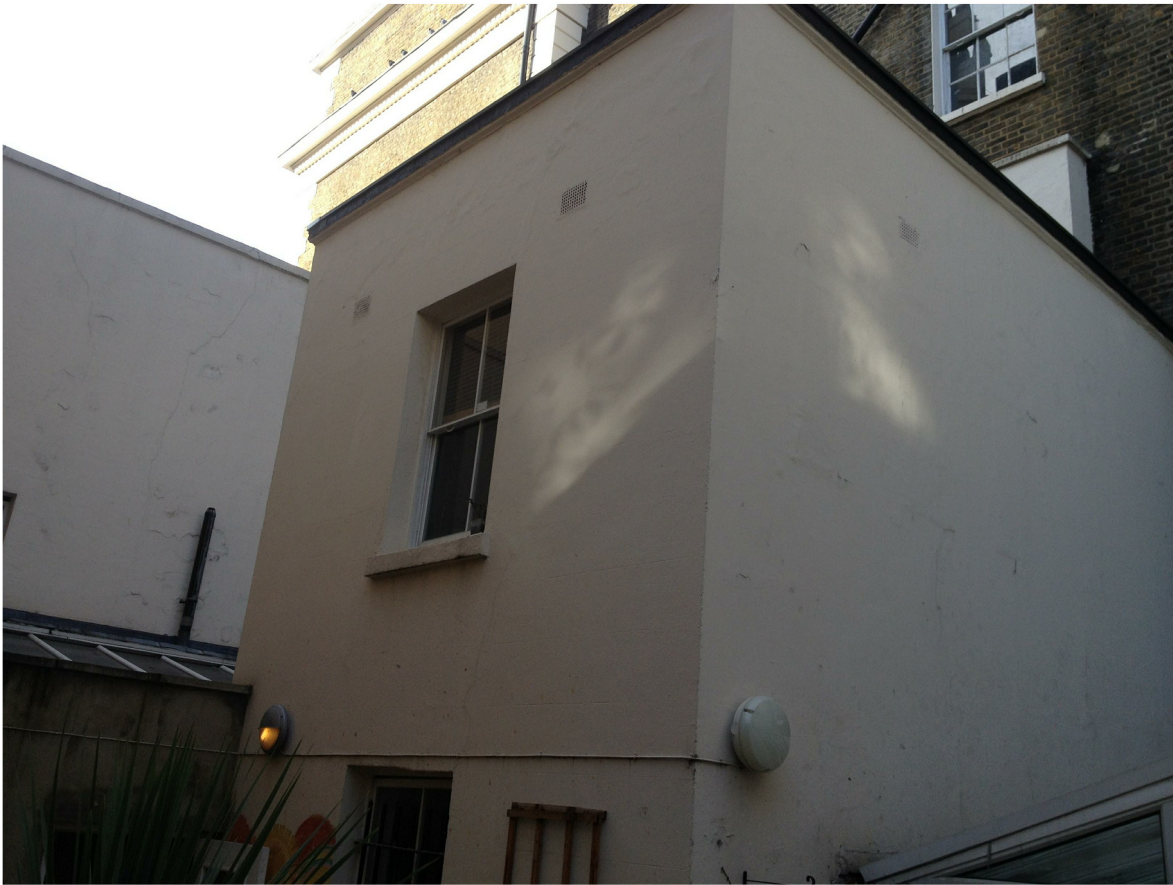
4. Existing extension