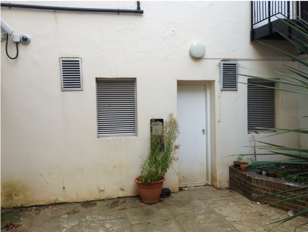
1. Eastern part of the backyard