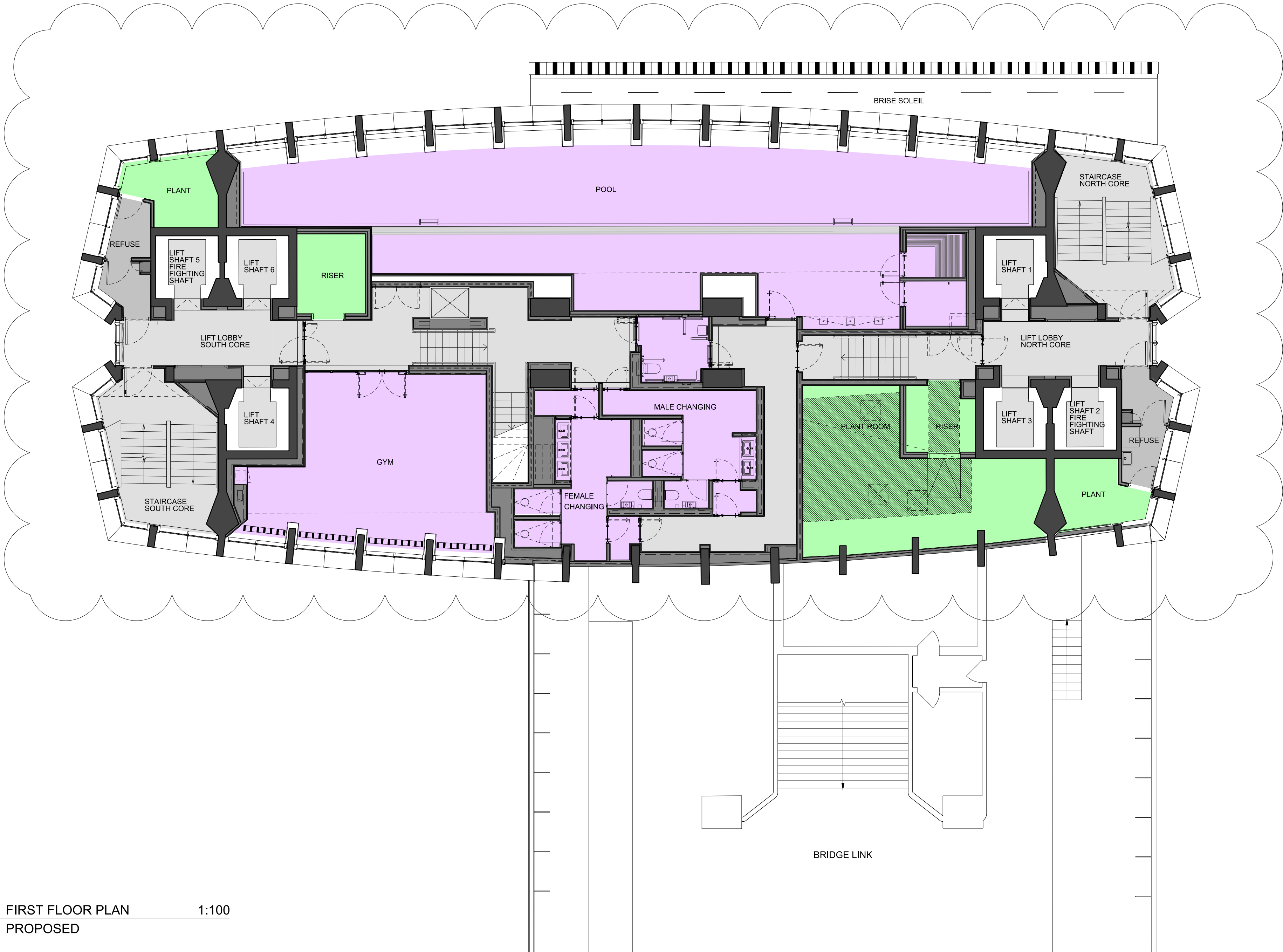
1 FIRST FLOOR PLAN PROPOSED 1:100