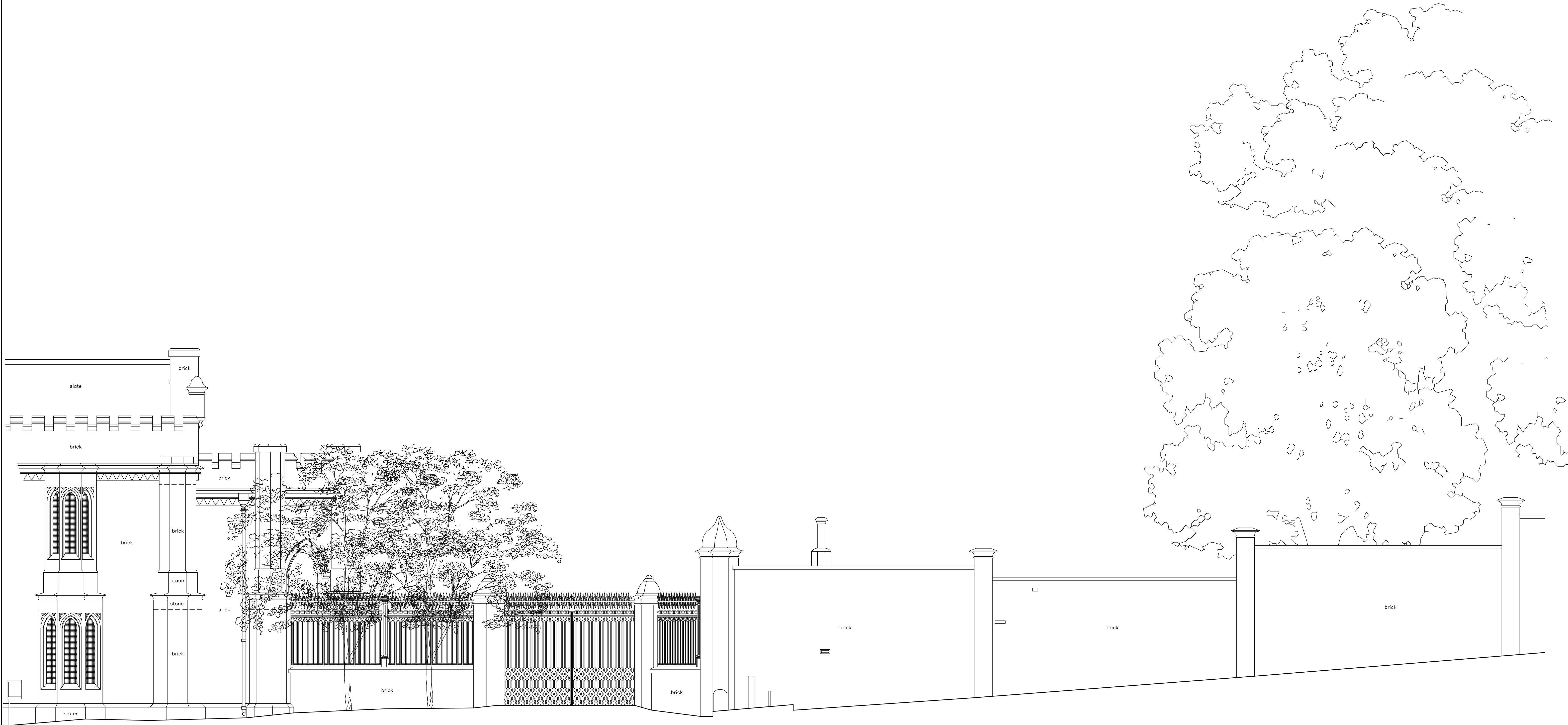
ELEVATION D - D (True View) 87.00m A.O.D.

THIS SURVEY HAS BEEN PREPARED WITH A SCALING ACCURACY FOR A PLOT AT A SCALE OF 1/50 ALL LEVELS ARE IN METRES DERIVED FROM GPS TRANSFORMATION OSGM02 THE CO-ORDINATES ARE DERIVED FROM THE ORDNANCE SURVEY ACTIVE STATION NETWORK OSTM02 (BASE STATION ST01)