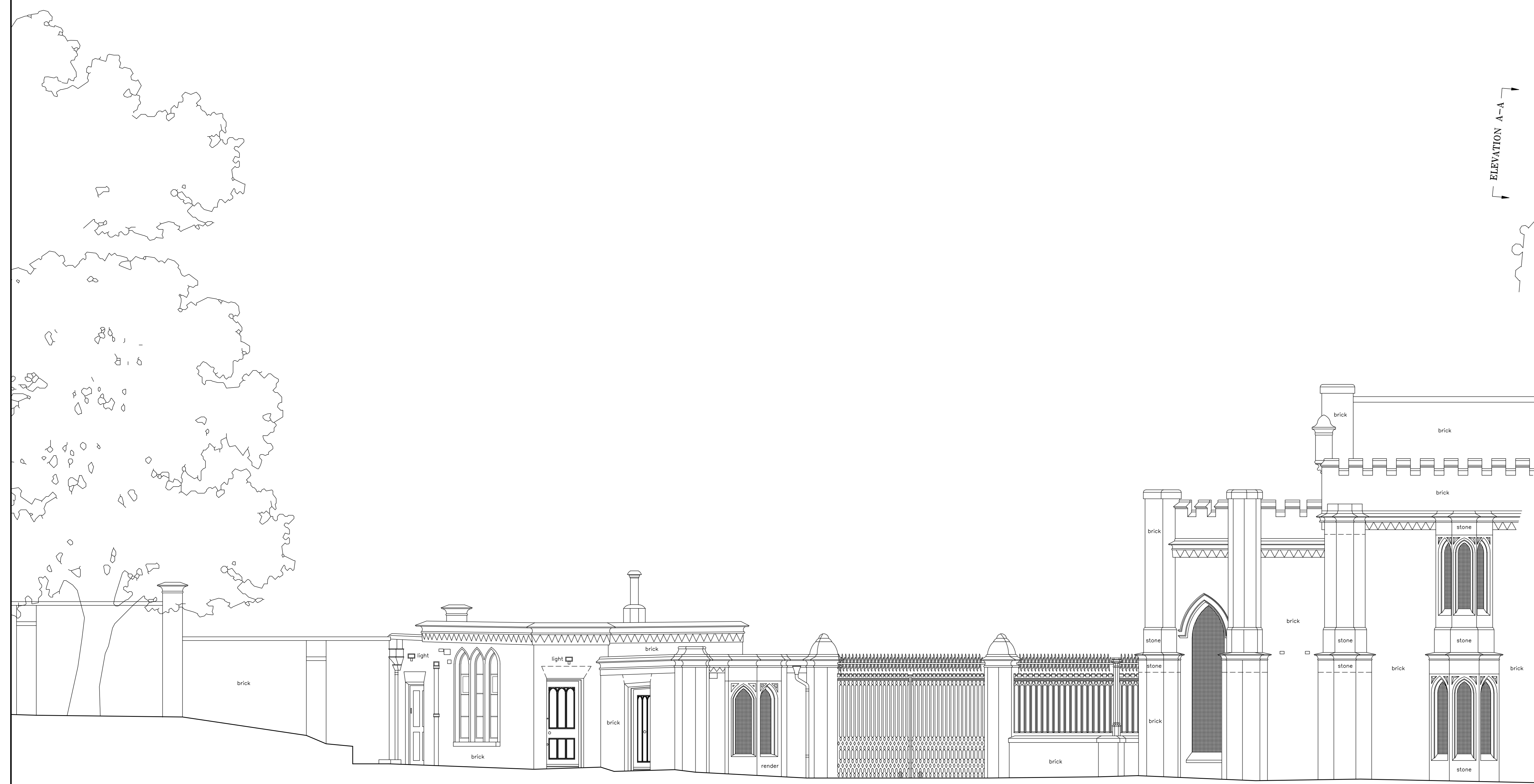
ELEVATION A - A (True View) 87.00m A.O.D.