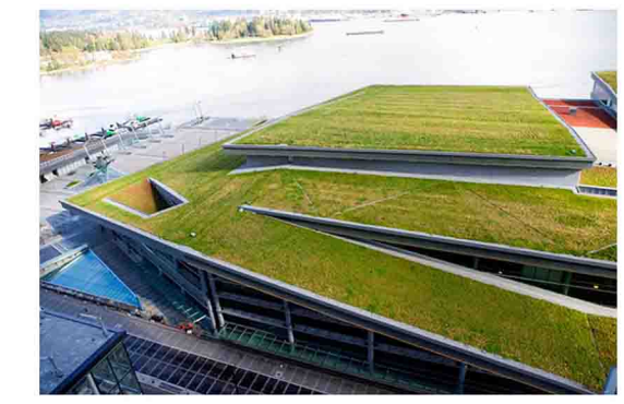
Extensive Green Roof