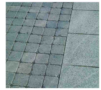
H.Q. Printed Concrete (dark and light)