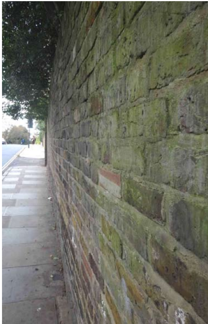
VIEW ALONG PAVEMENT TO SHOW BULGING IN WALL