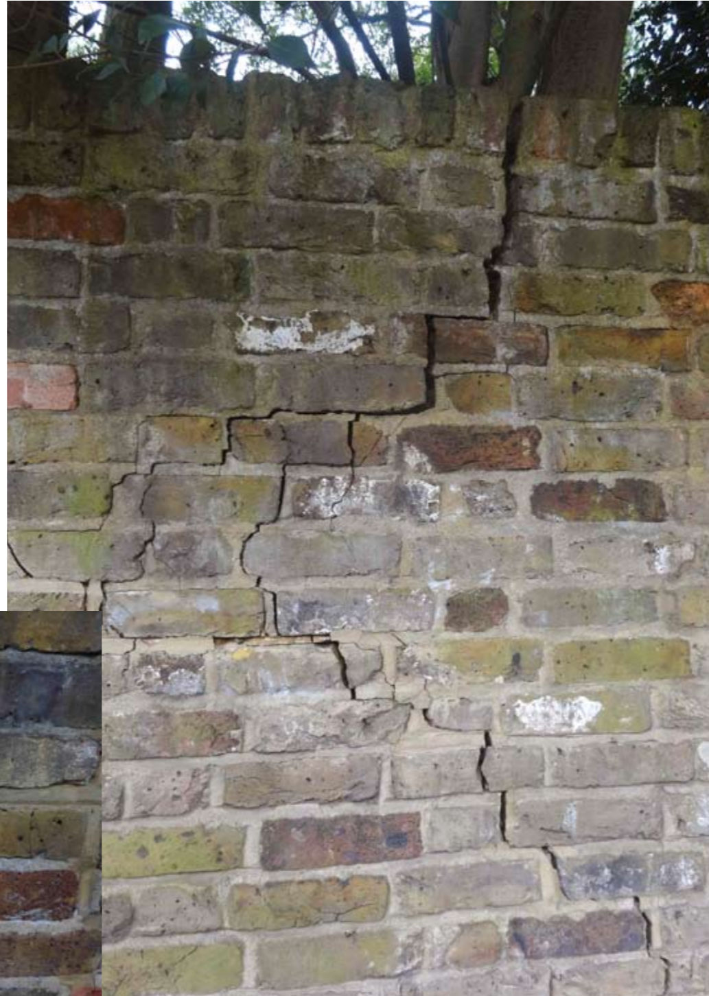
VIEW FROM PAVEMENT TO SHOW CRACKING IN WALL