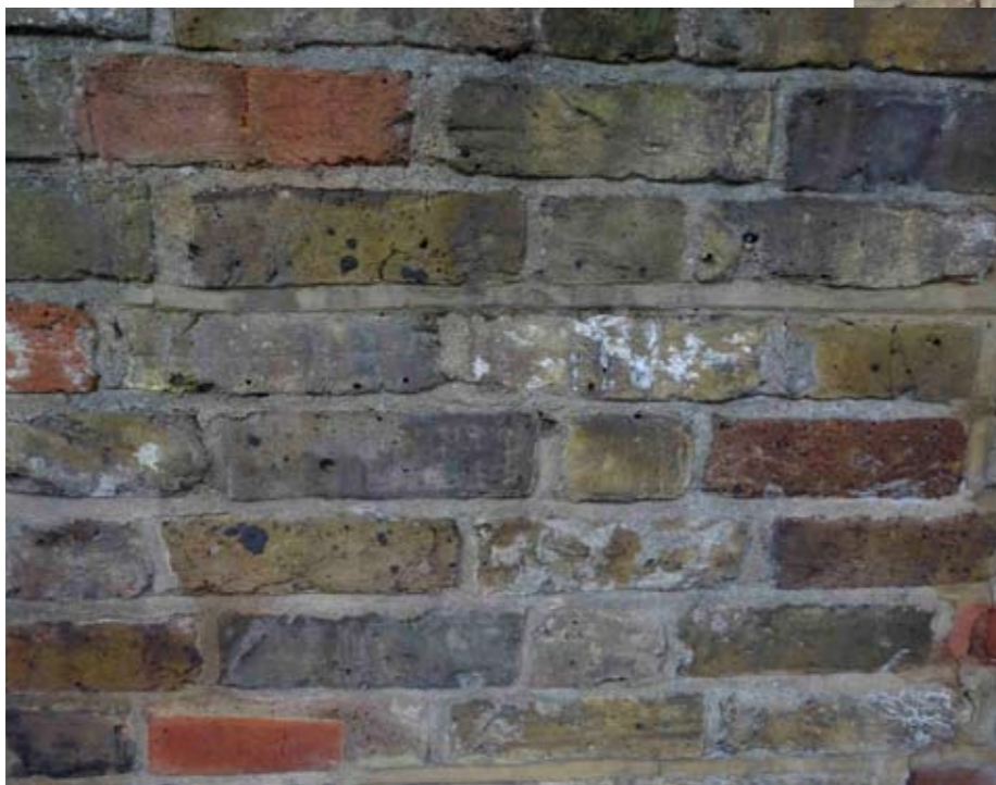
DETAIL OF EXISTING BRICKWORK