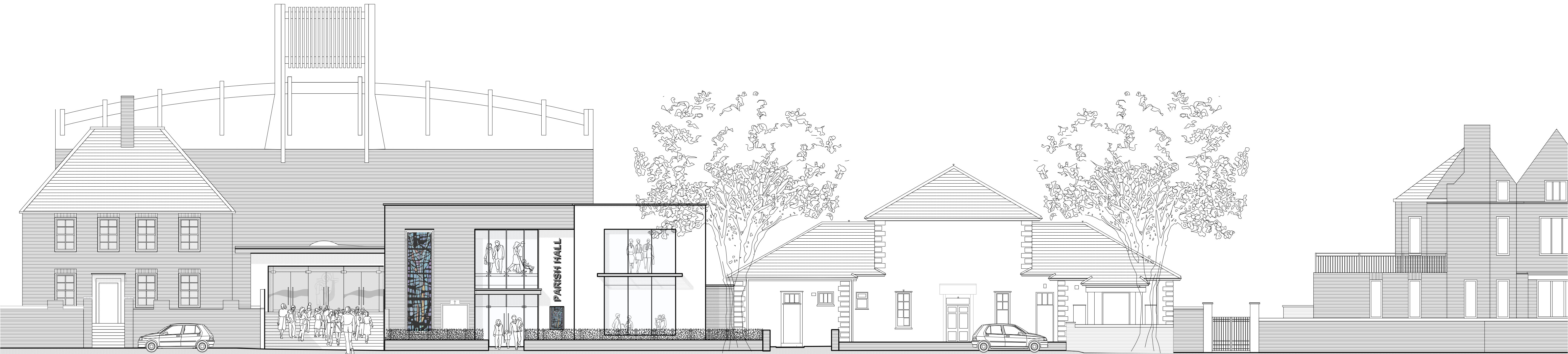
Proposed Street Elevation 1:100