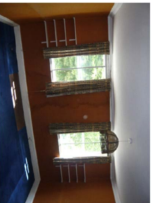
Overhaul and repair sash windows. Retain skirting and floorboards. Existing ceiling and cornice to be retained and repaired from water damage. At new bedroom wall partition, mould new plaster cornice to match existing. ANY NEW PARTITION IS TO BE SCRIBED AROUND THE CORNICE & MIN 100MM AWAY FROM THE FIRE PLACE.