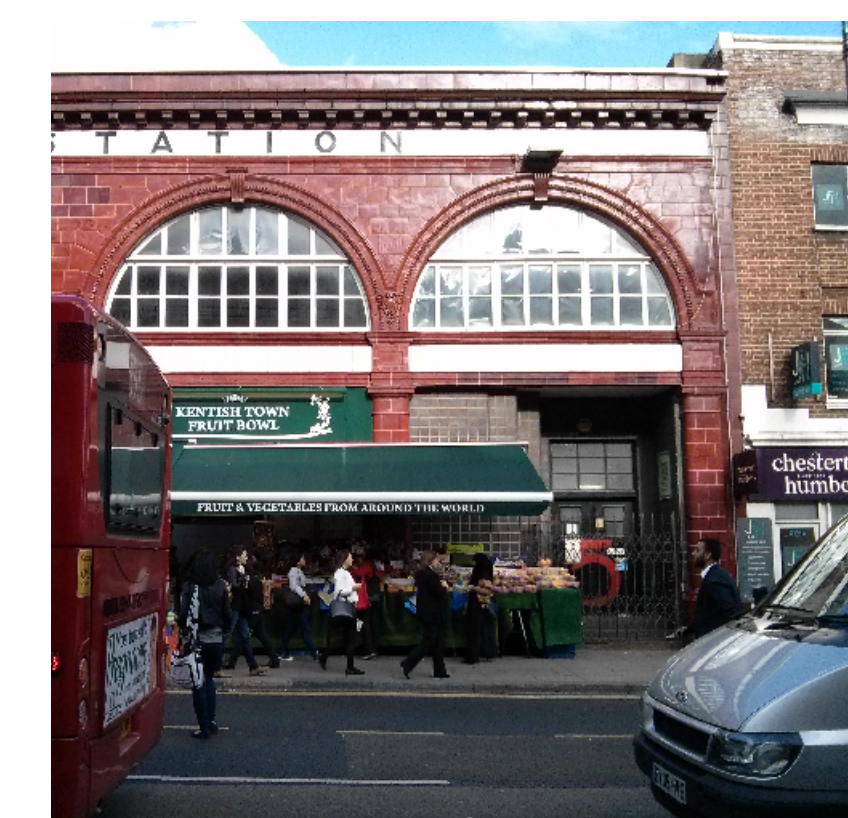
2 PHOTOS OF EXISTING SHOP FRONT Scale: Actual Size