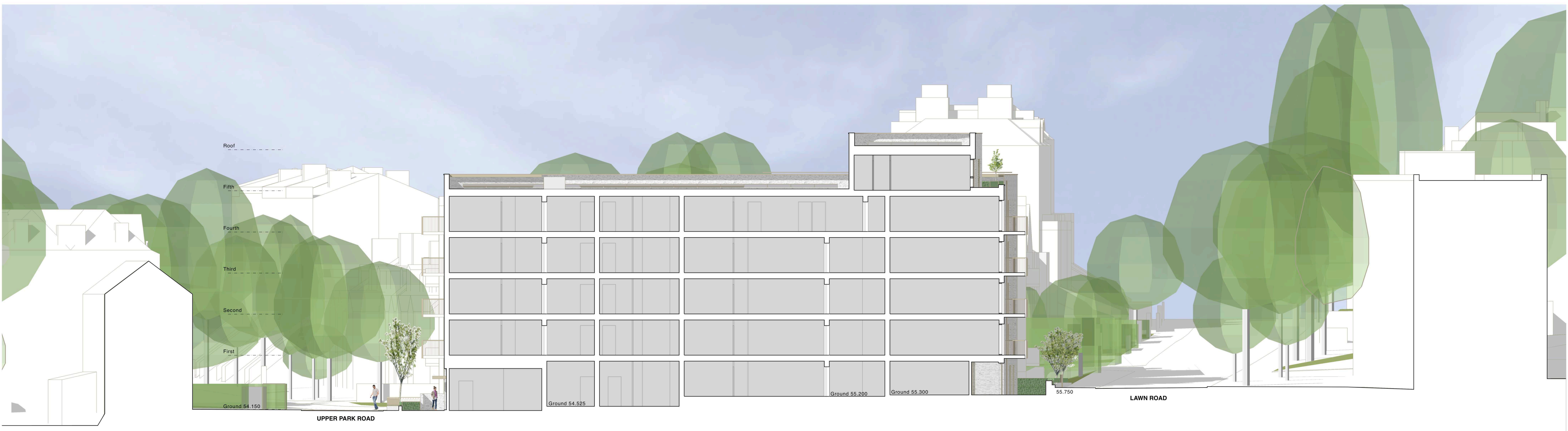
UPPER PARK ROAD