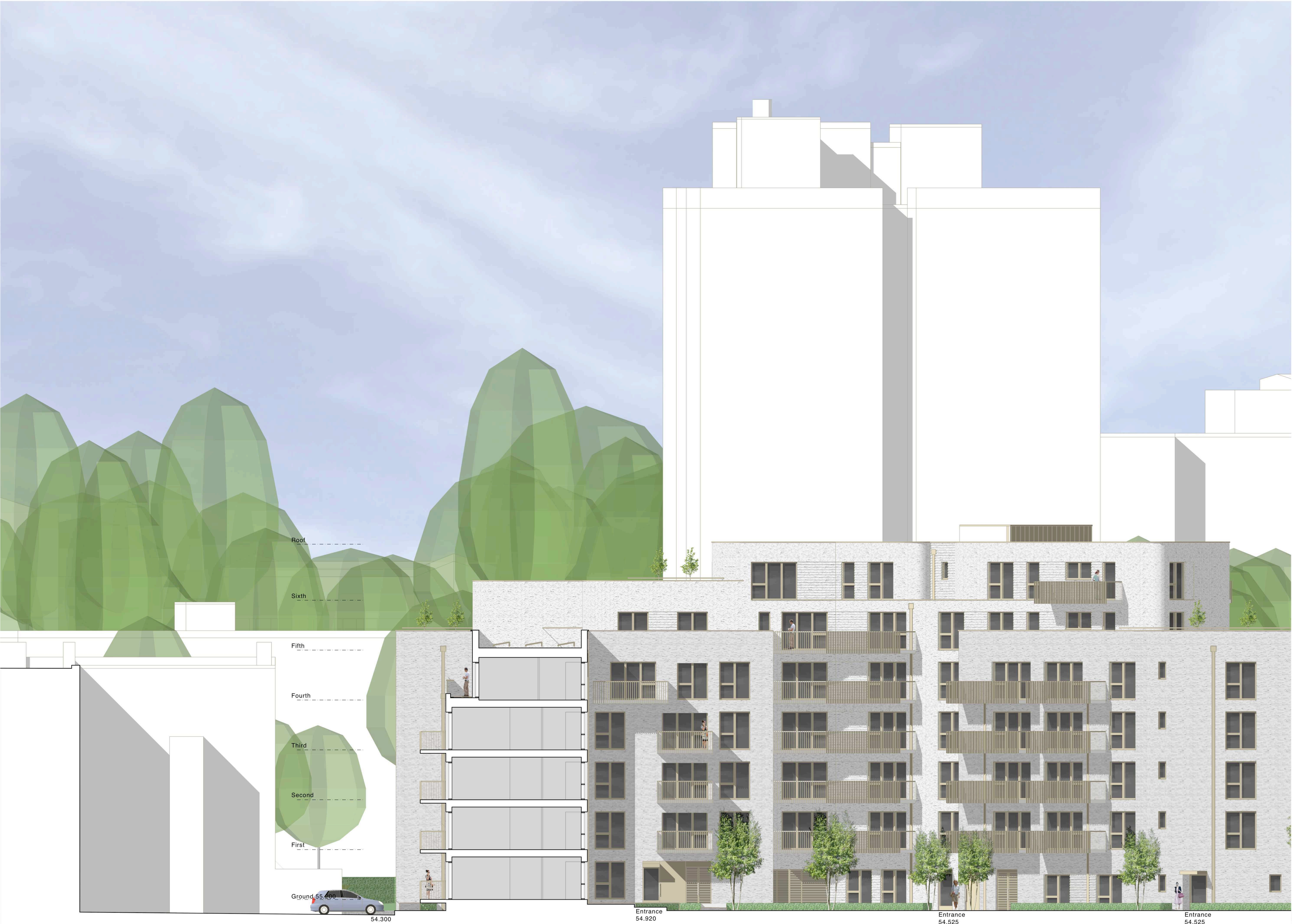
SITE SECTION CC