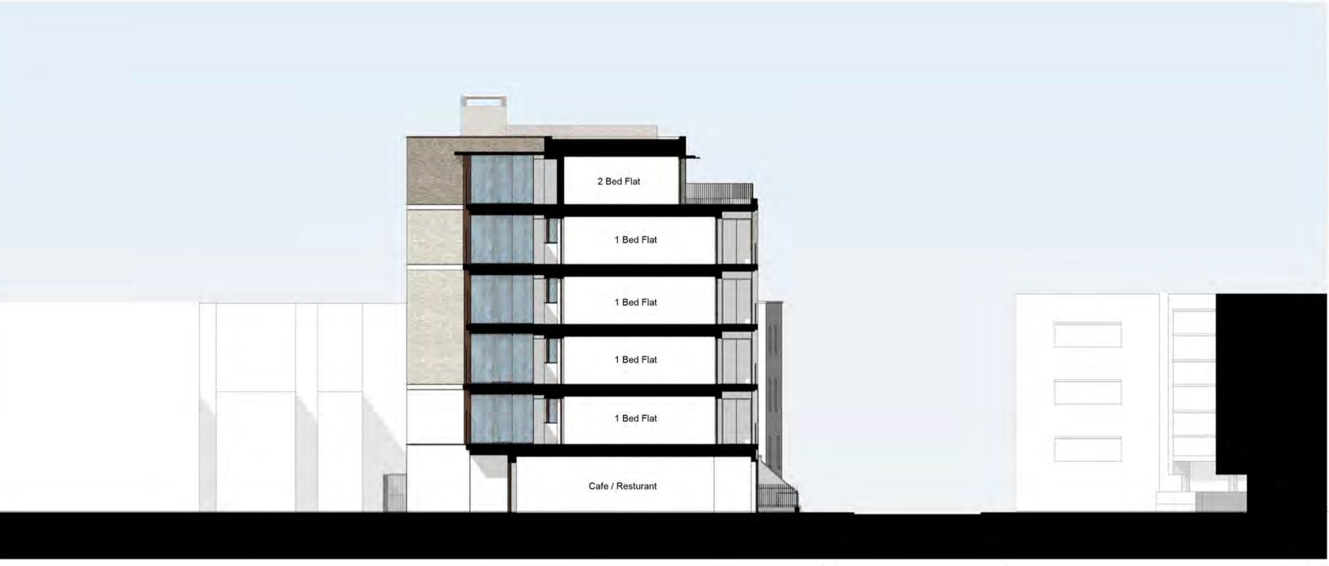
Section - BB 1 : 200