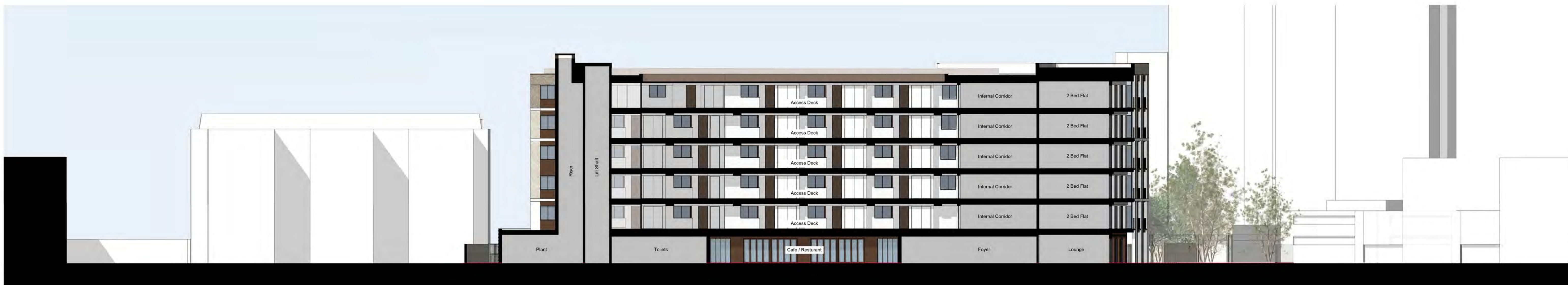
Section AA 1 : 200