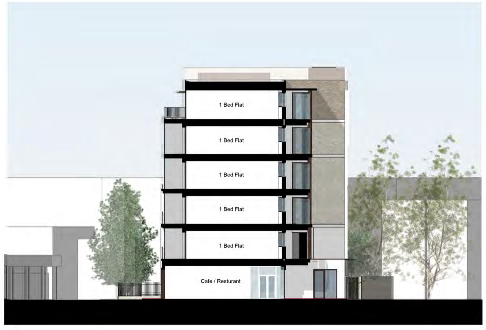
Section - CC 1 : 200