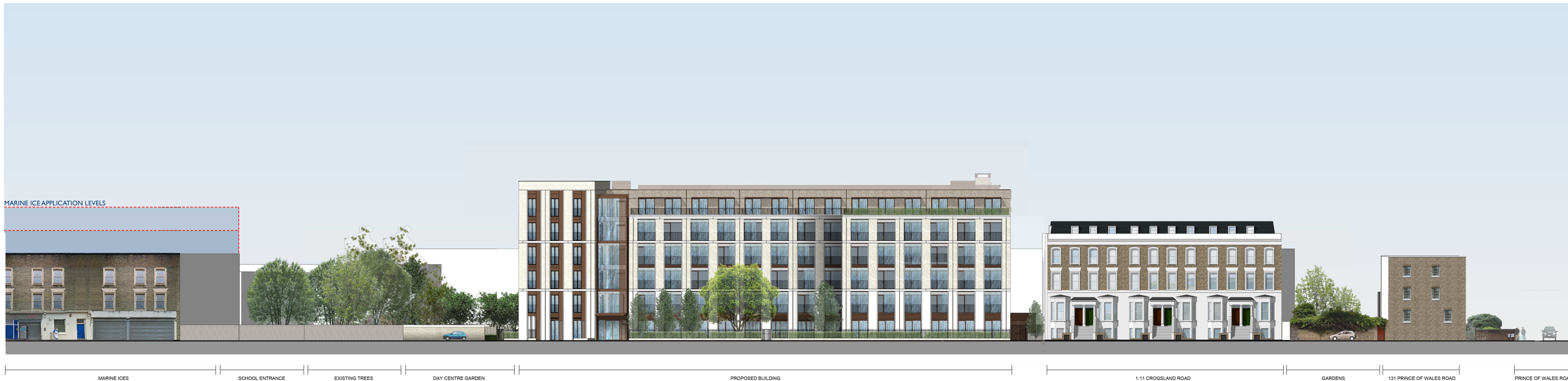
Croglands Road, Street Elevation (East Elevation) 1 : 250