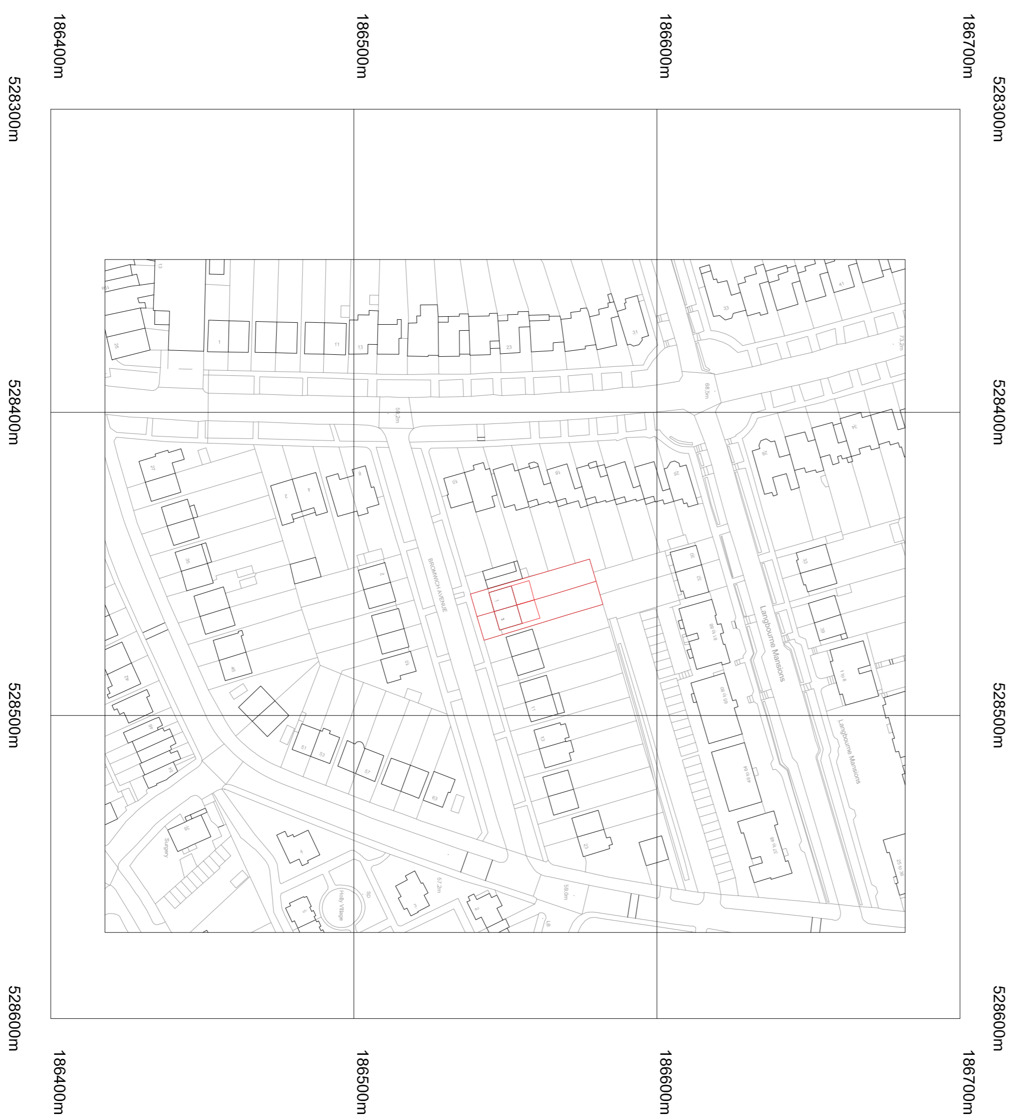
01. LOCATION PLAN 1:1250