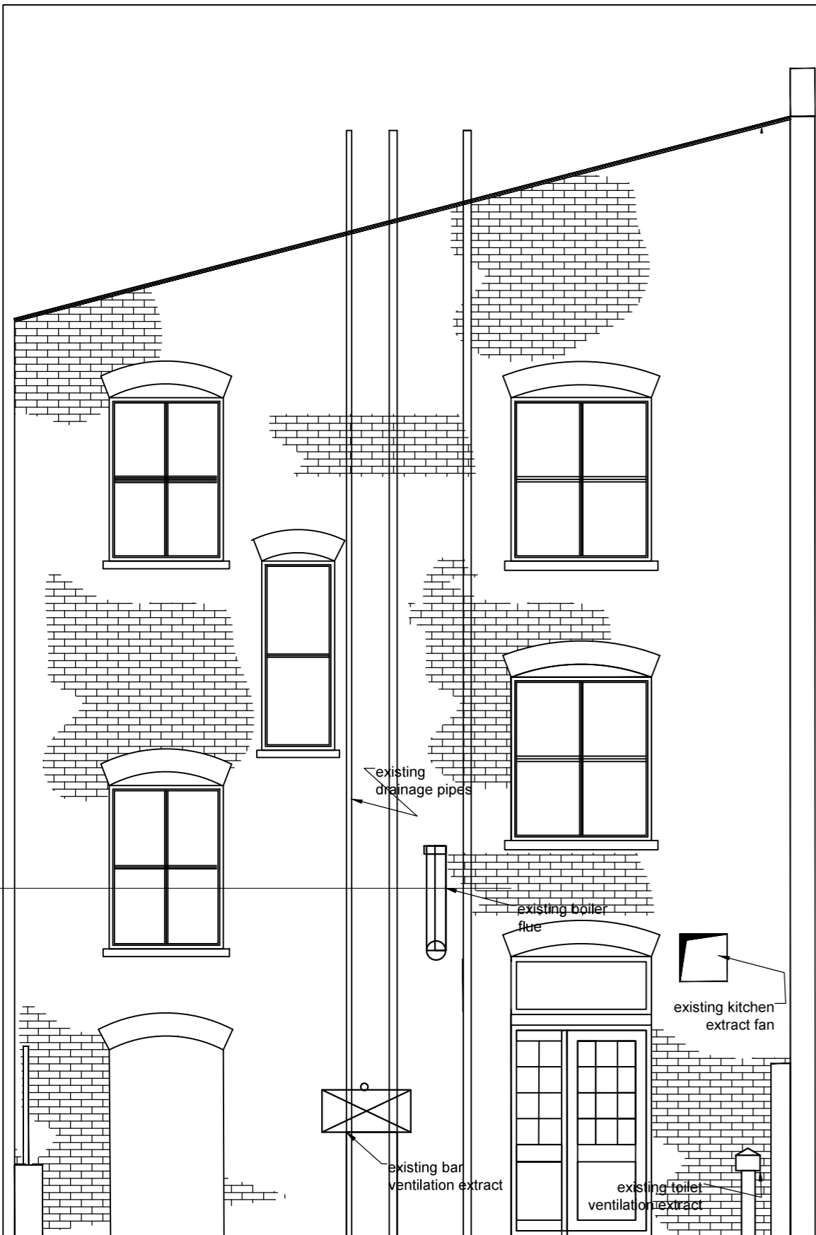
THE SMUGGLERS TAVERN Rear Elevation as Existing scale 1-50.

VIEW C-C SIDE ELEVATION FROM OUTSIDE KITCHEN ITEMS SHOWN: EXTRACT DUCTWORK AND PART OF SUPPLY AIR DUCTWORK