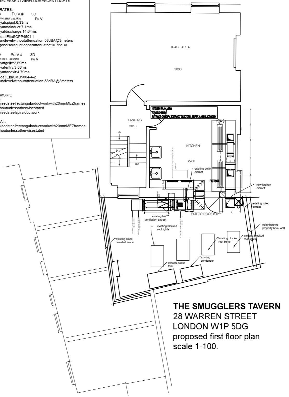
THE SMUGGLERS TAVERN 28 WARREN STREET LONDON W1P 5DG proposed first floor plan scale 1-100.

Rev A. Ventilation terminated 1 m above the roof line. PS 09-02-2015.