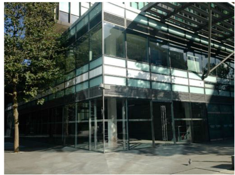
03 EXISTING PICTURE