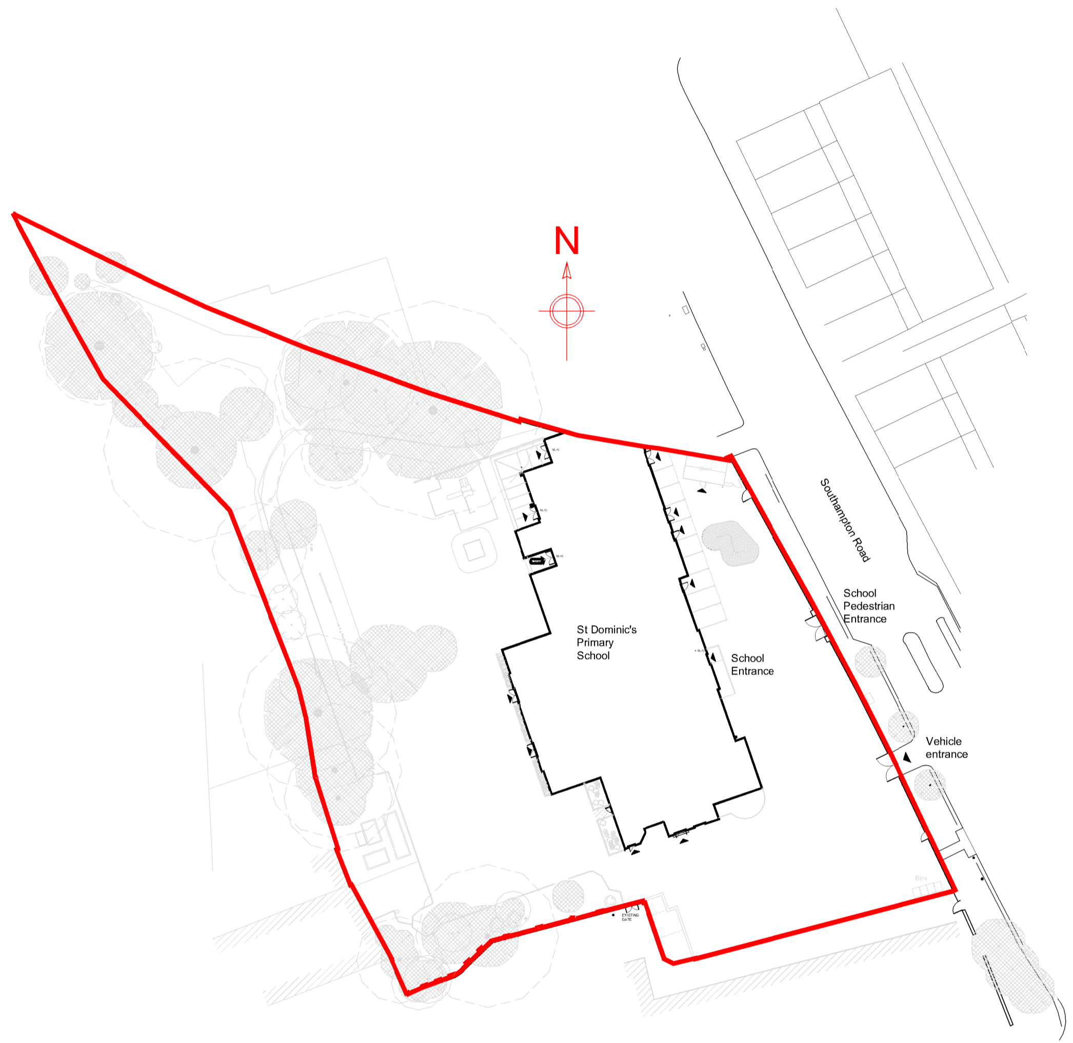
EXISTING SITE PLAN (Scale 1:500)