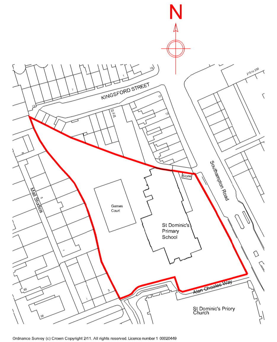
LOCATION PLAN (Scale 1:1250)