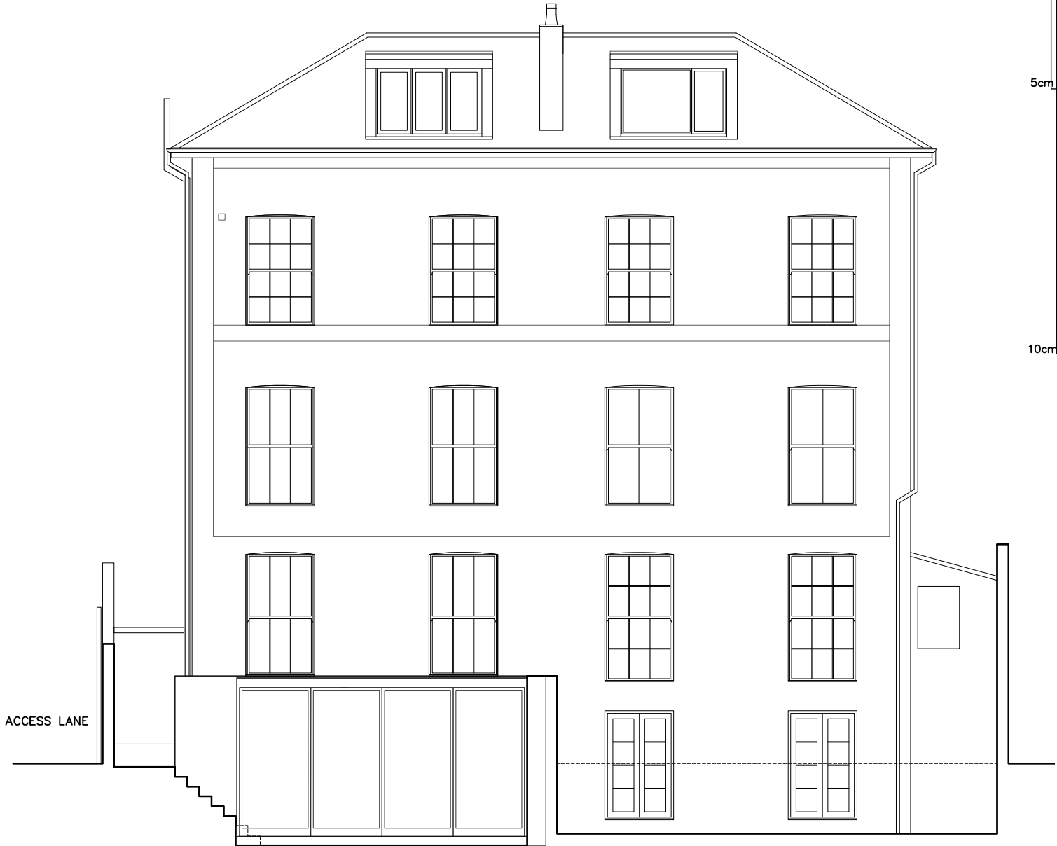
NO.1 BRIDGE APPROACH