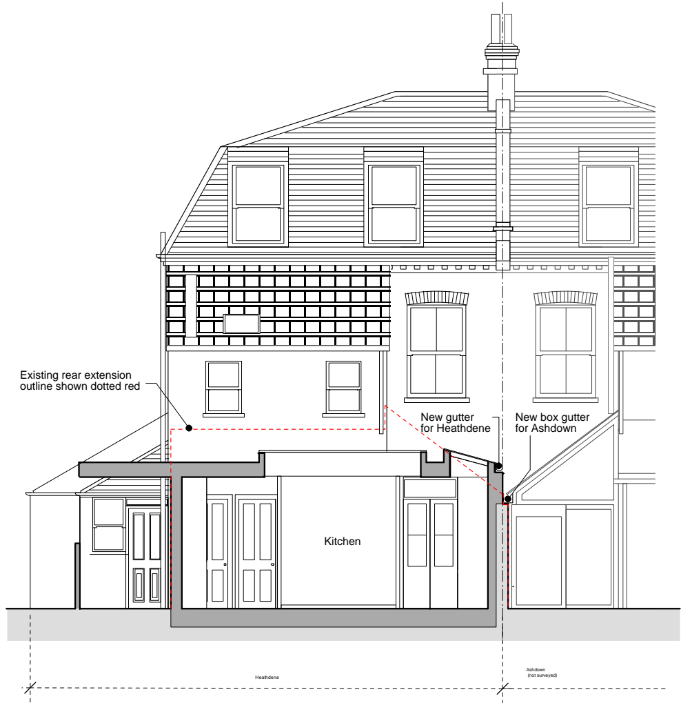
SECTION C-C AS PROPOSED