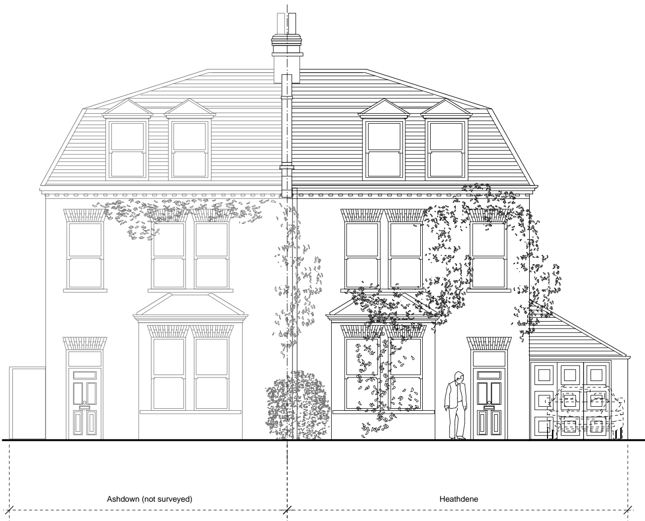
FRONT ELEVATION AS EXISTING 1:100 (NO CHANGE)