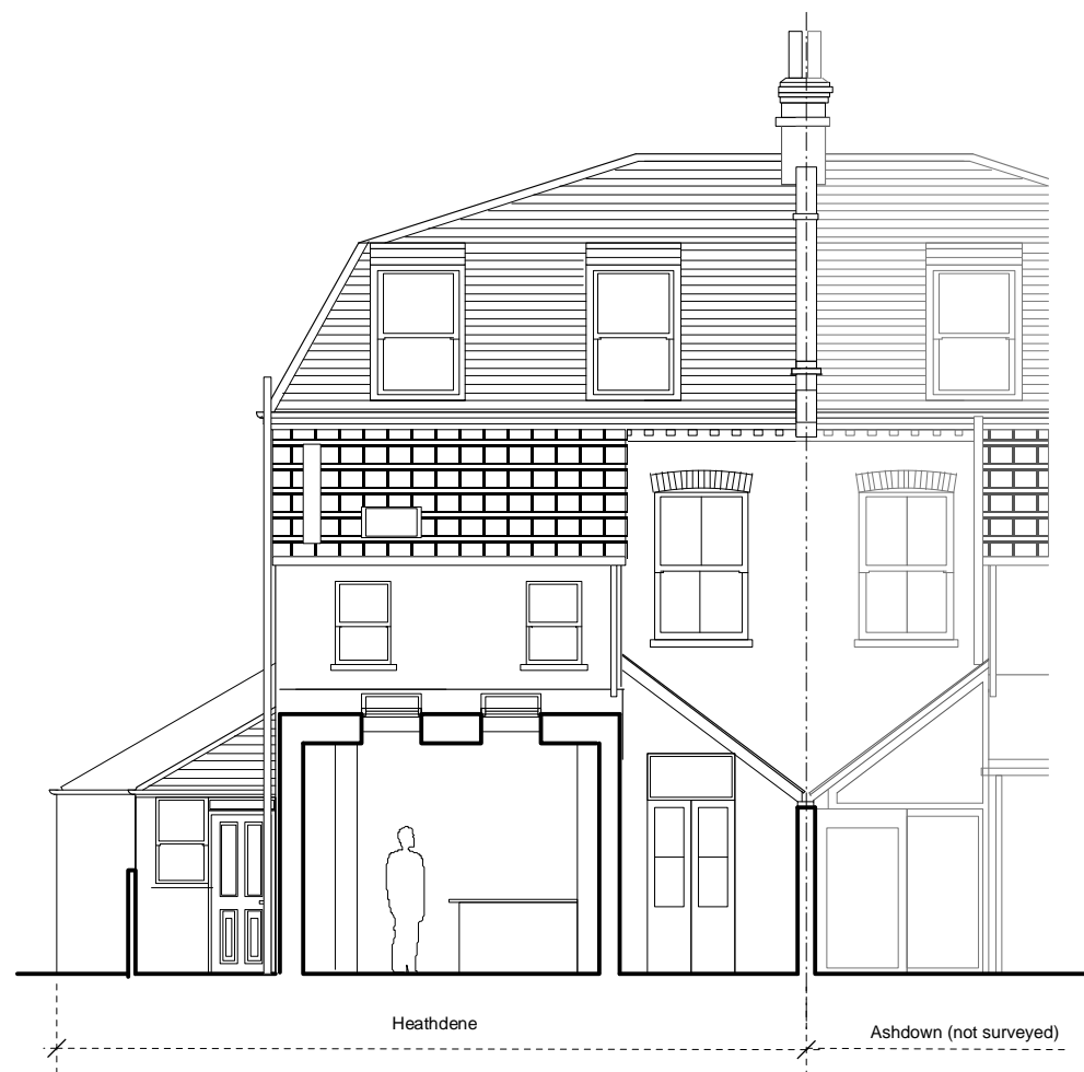
SECTION C-C AS EXISTING 1:100