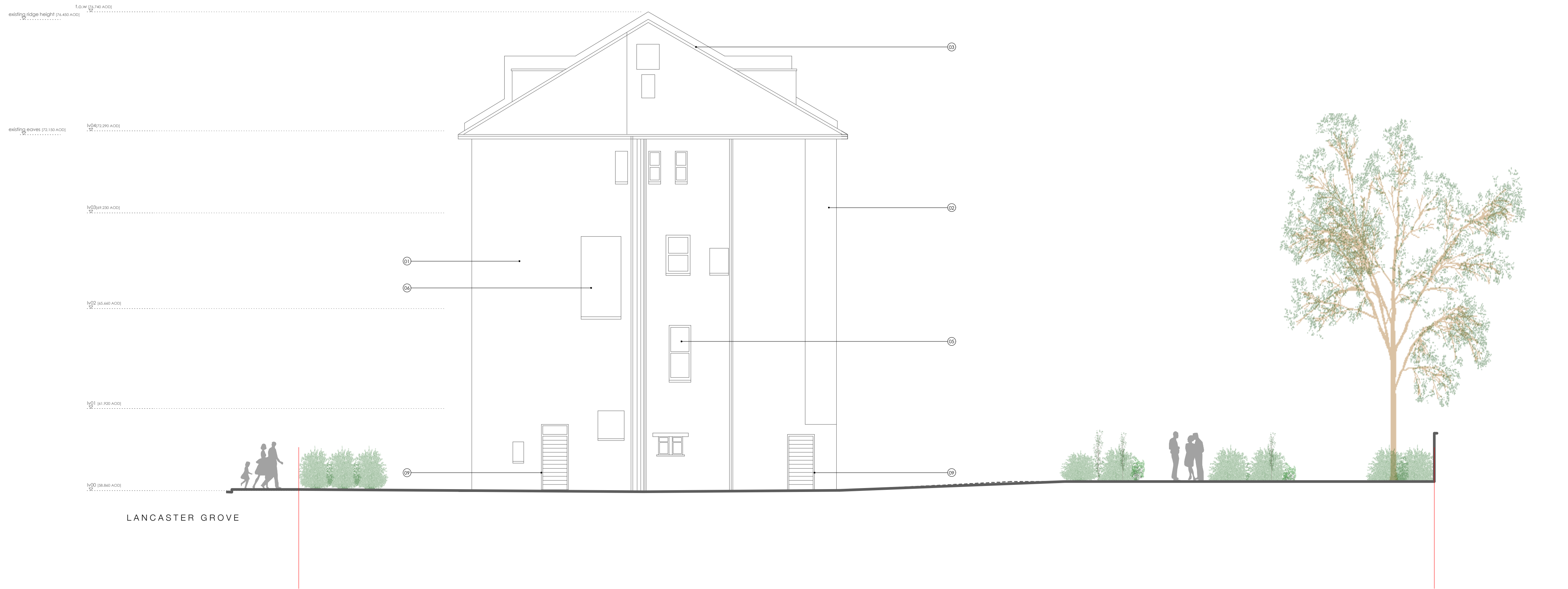
02 PROPOSED SOUTH-EAST ELEVATION [SE] SCALE 1:100