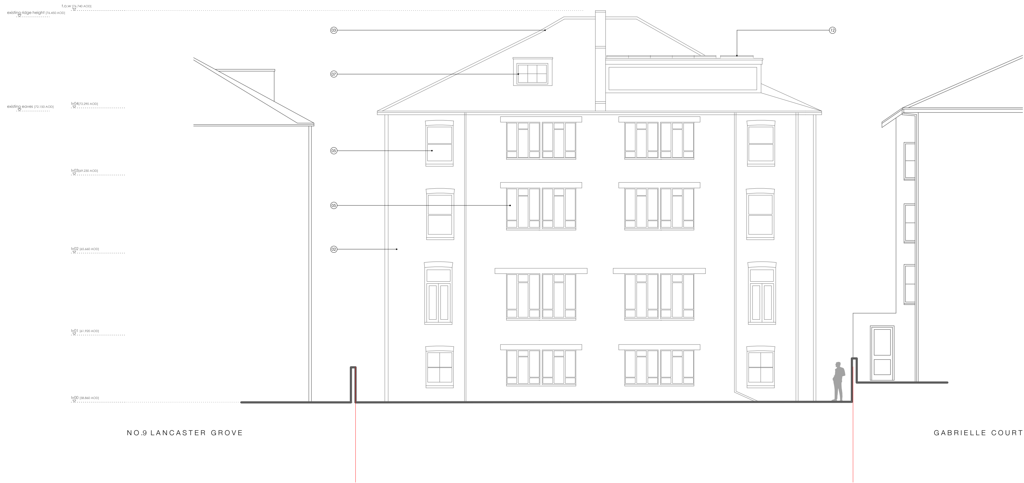
01 PROPOSED NORTH-EAST ELEVATION [NE] SCALE 1:100