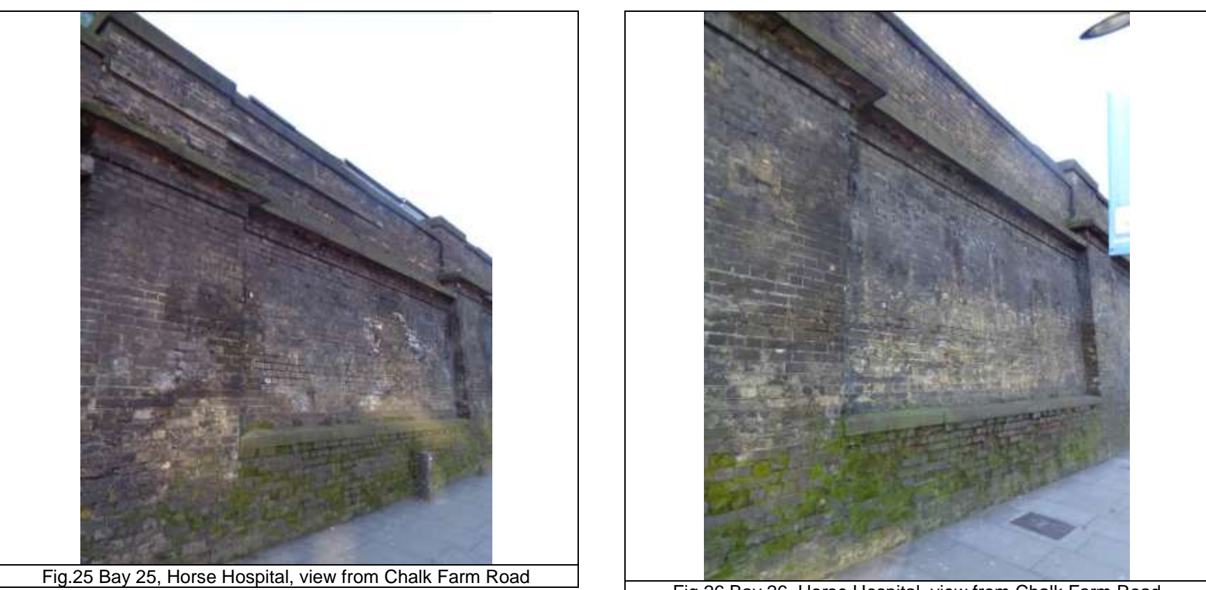
Fig.26 Bay 26, Horse Hospital, view from Chalk Farm Road