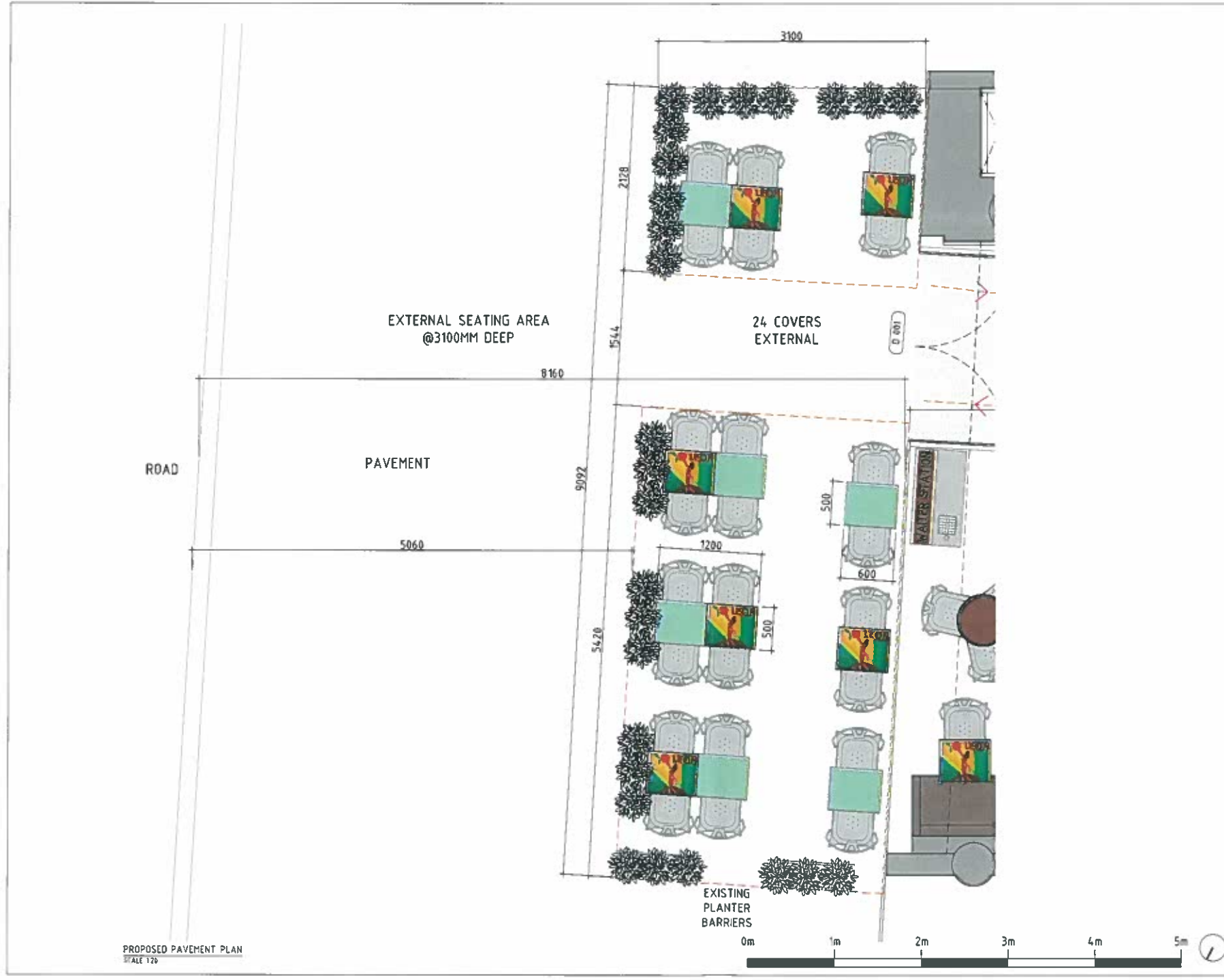
PROPOSED PAVEMENT PLAN SCALE 1:25

NOTES 1. THIS PLAN IS A PROPOSED PLAN AND IS NOT TO BE USED FOR CONSTRUCTION. 2. THE CLIENT IS RESPONSIBLE FOR OBTAINING ALL NECESSARY PERMITS AND APPROVALS. 3. THE CLIENT IS RESPONSIBLE FOR OBTAINING ALL NECESSARY PERMITS AND APPROVALS. 4. THE CLIENT IS RESPONSIBLE FOR OBTAINING ALL NECESSARY PERMITS AND APPROVALS. 5. THE CLIENT IS RESPONSIBLE FOR OBTAINING ALL NECESSARY PERMITS AND APPROVALS.